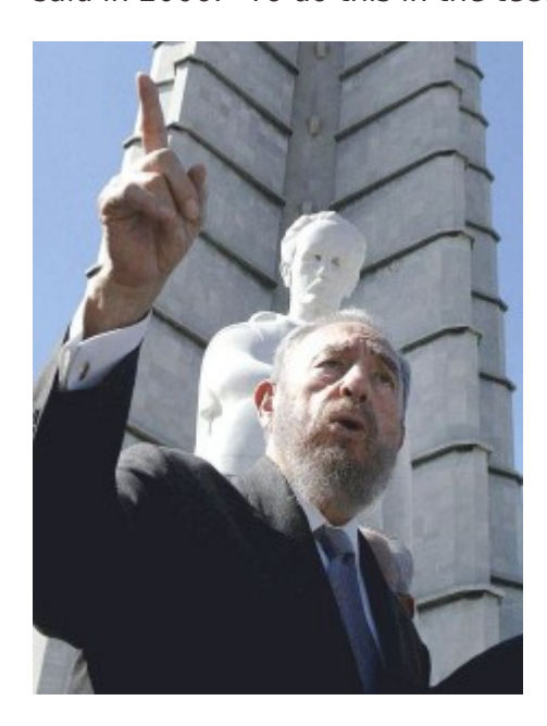
Cuban leader Fidel Castro speaking at the Jose Marti Monument in 2003.

by the United States for almost half a century and yet it's been able to give its people the best standard of health care, brilliant education," Ken Livingstone, former mayor of London, said in 2006. "To do this in the teeth of an almost economic war is a tribute to Fidel Castro."