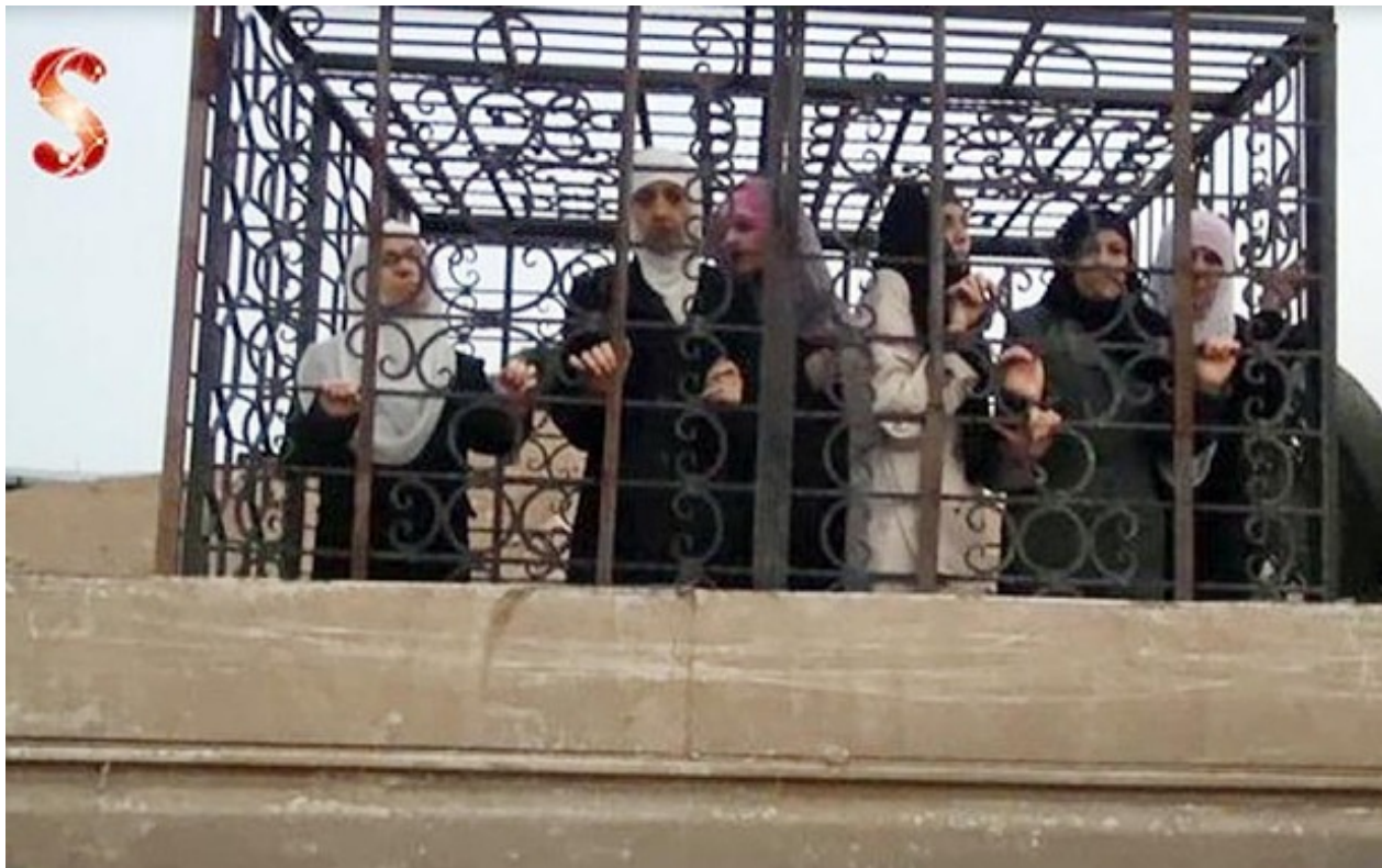
Jaish al Islam terrorists hold Alawite women in cages in Damascus suburbs