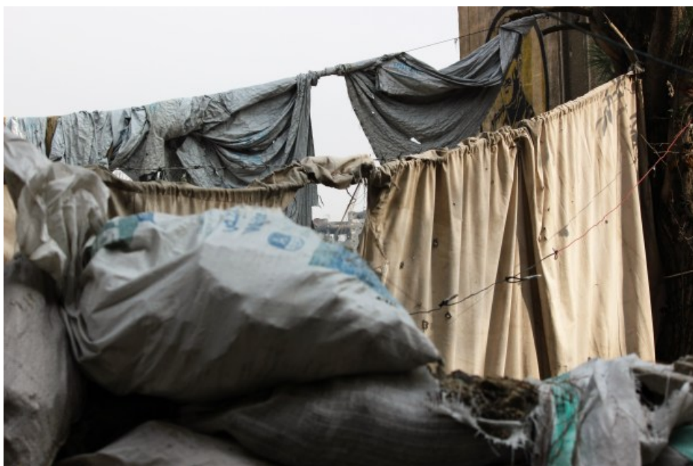
Entrance to the old HQ of the RSCD in Al Abassiyn, Jobar. Now an SAA outpost containing the Jaish al Islam, Nusra Front occupation.

“The original headquarters were close to Al Abassiyn square in Jobar, an area that has been intensively targeted by the terrorist factions, Jaish al Islam and Nusra Front. We were constantly under attack. One day I was leaving the buildings and going to my car. A mortar hit near the car. Three RSCD members were killed in that attack, my driver received a serious head injury and was paralysed..eventually he was discharged. After that attack we vacated that building and moved to this building. The Syrian Arab Army took over the old building and turned it into a defence against the terrorist factions in Jobar, Jaish al Islam, Nusra Front and others”