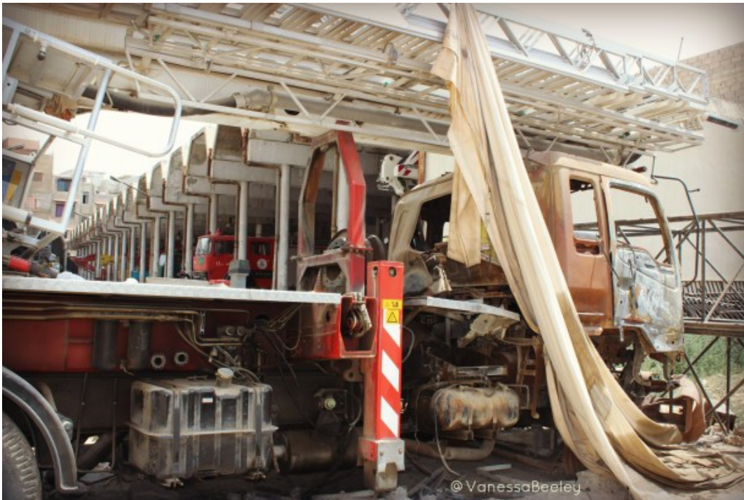
Truck targeted by NATO state terrorist groups in Homs, killing 3 RSCD crew members instantly.

In April 2014, the Damascus RSCD took part in an emergency call out to Deir Atiyah near Homs. The area had been under attack from Nusra Front and civilians were buried under the rubble of shelled buildings and homes. The fire engine was despatched with full crew, as they neared the site of the shelling, where many civilians were injured or already dead under the rubble, a guided missile fired by the Nusra Front led armed groups, hit the fire engine, killing three crew members immediately. One of those crew members had over 40 years experience in Urban Search and Rescue (USAR). That kind of loss is irreplaceable for these humanitarian organisations.