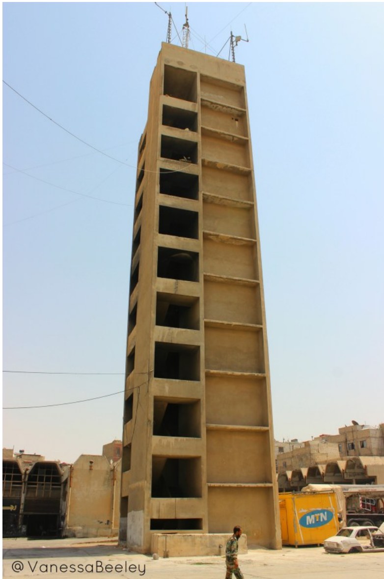
Training tower in REAL Syria Civil Defence HQ, Damascus.

The colonel in charge of the Damascus RSCD centre told me that since the “crisis” began, six years ago, there have been many invasions of RSCD centres across Syria. Crews have been massacred or kidnapped, ambulances, fire engines and equipment stolen by the invading extremist groups, including Nusra Front, Ahrar al Sham and ISIS.