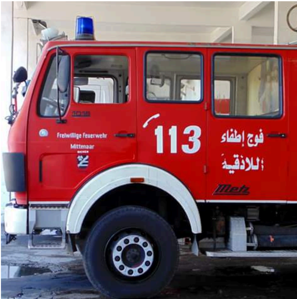
The number you call for the REAL Syria Civil Defence inside Syria.

During my three trips to Syria in 2016, in July, August and December, I met with the REAL Syria Civil Defence crews in West Aleppo [many originally from East Aleppo], Lattakia, Tartous and Damascus.