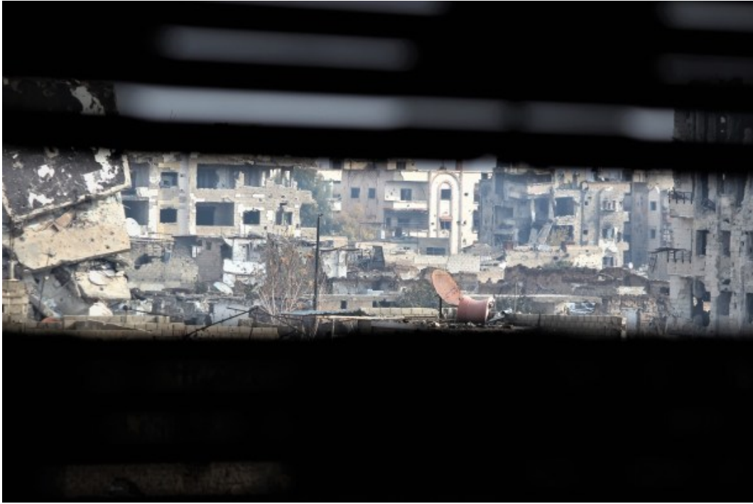
Room with a view of Jobar through one of the SAA sniper slits in the windows overlooking the Jaish al Islam/Nusra Front occupied 4 km sq of Jobar.

INTERNATIONAL CIVIL DEFENCE ORGANISATION, GENEVA