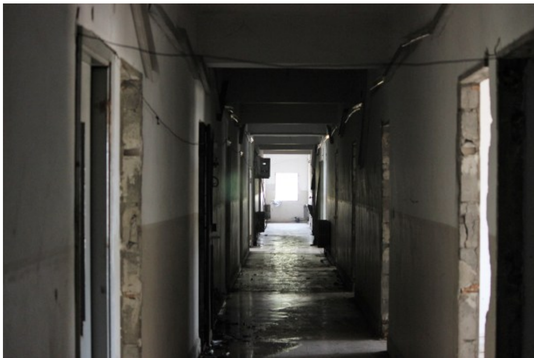
The entire RSCD building had been converted into a military outpost with all rooms sandbagged and windows turned into sniping points.