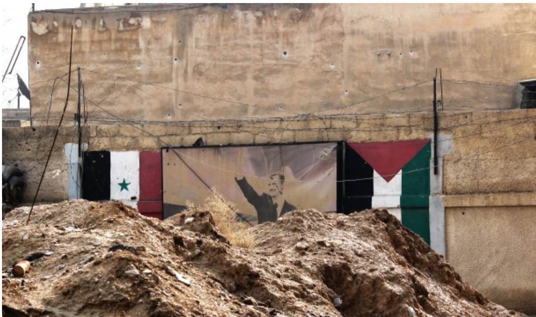
Trenches had been dug to prevent NATO state funded terrorist groups digging tunnels under the SAA compound and detonating them.