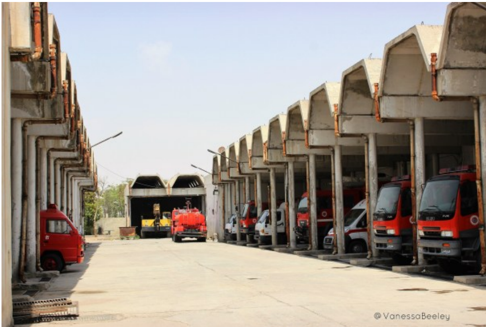
The vehicle yard of the RSCD in Damascus.

“The White Helmets are armed militia, they are the same as the Free Syrian Army (FSA) but with the ideology of Nusra Front, they are sectarian and extremist” ~ RSCD commander in Damascus.