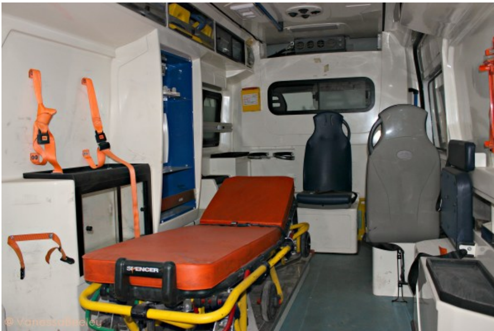
RSCD ambulance stripped of essential equipment by armed groups in Hama.

"I'm proud to say we're giving them I think £32 million [US$39.78 million] funding as part of a wider £65 million package for non-humanitarian aid," ~ Boris Johnson