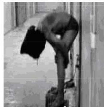
TORTURE and OTHER CRUEL INHUMAN or DEGRADING TREATMENT OR PUNISHMENT