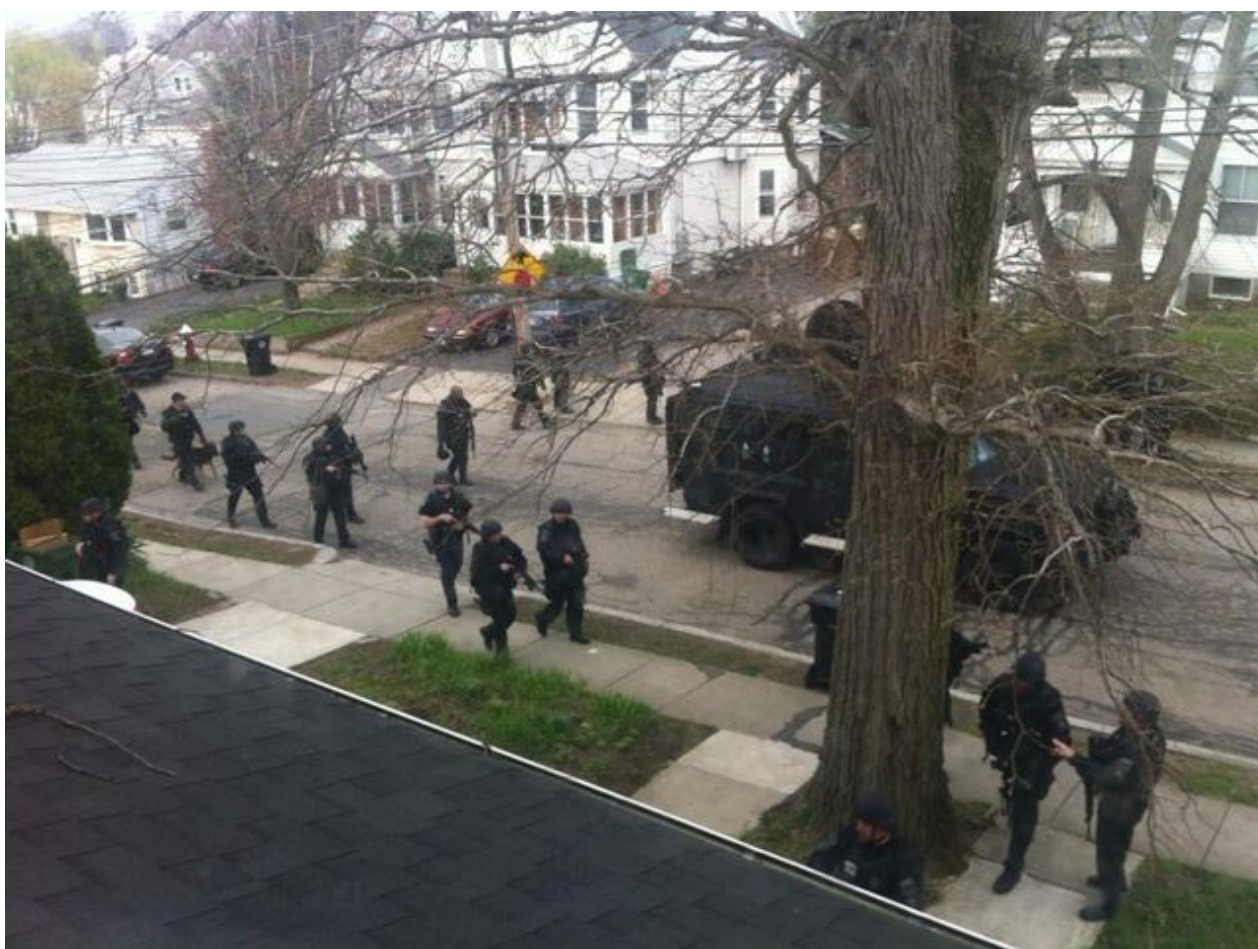
Image: Military forces doing house-to-house searches during the Boston lockdown in April, 2013

As Vladimir Lenin explained in his epochal work, The State and Revolution , beginning from the late 19th century, the development of the capitalist state in general has been characterized by the “perfecting and strengthening of the ‘executive power,’ its bureaucratic and military apparatus.”