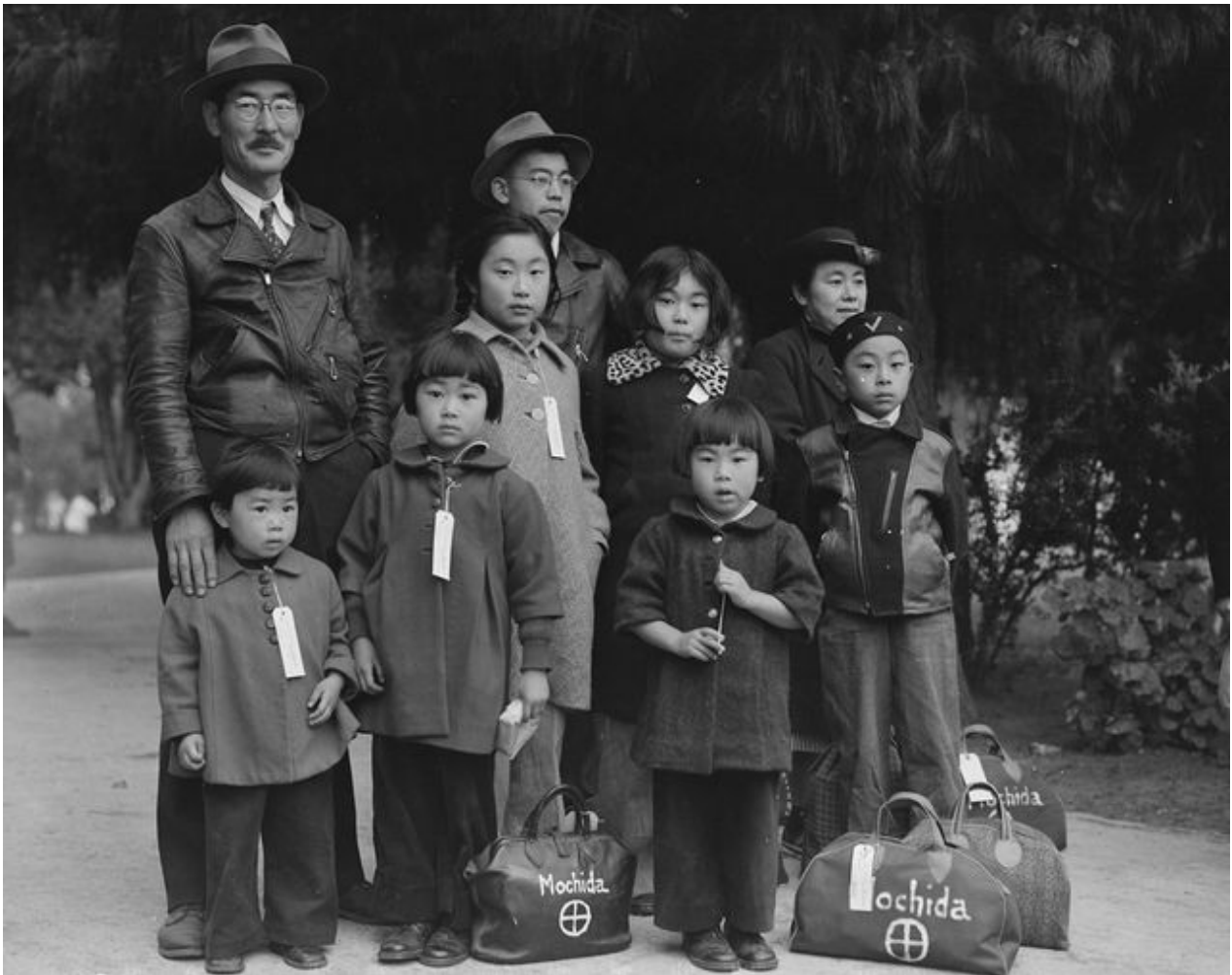
The Mochida family awaits evacuation to an internment camp in 1942

In the aftermath of the 1967 urban upheavals, DOD established the Directorate of Civil Disturbance Planning and Operations as a permanent body to oversee plans for suppression of domestic unrest by federal troops.