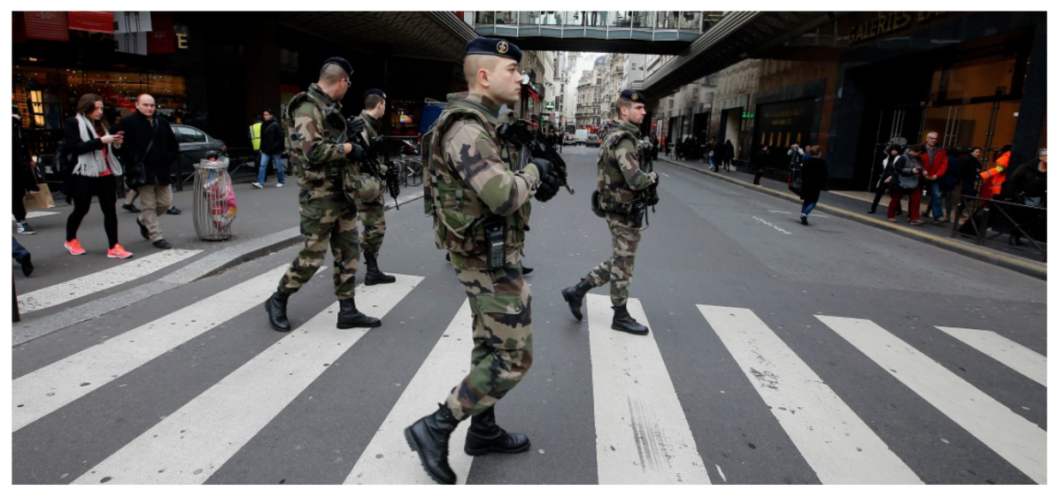
Des militaires français marchent dans les rues de Paris dans le cadre du plan Vigipirate, en janvier 2015.

Robin Panfili | France | 02.10.2015 - 10 h 45 | mis à jour le 02.10.2015 à 12 h 45