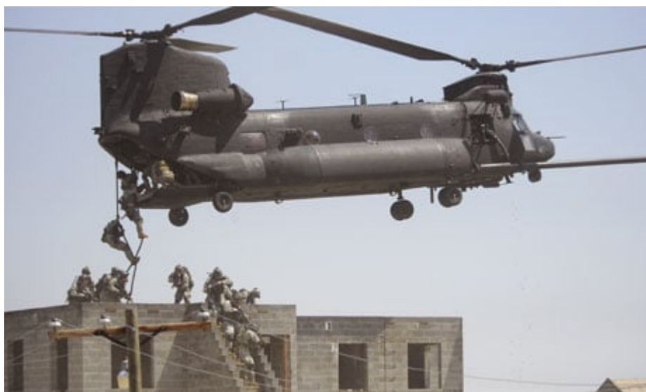
Prior exercise of Navy Seals

The Navy Seals allegedly flew from the Jalalabad airbase in Afghanistan in the two 'modified' Black Hawk helicopters and landed in OBL's Abbottabad compound some 90 minutes later.