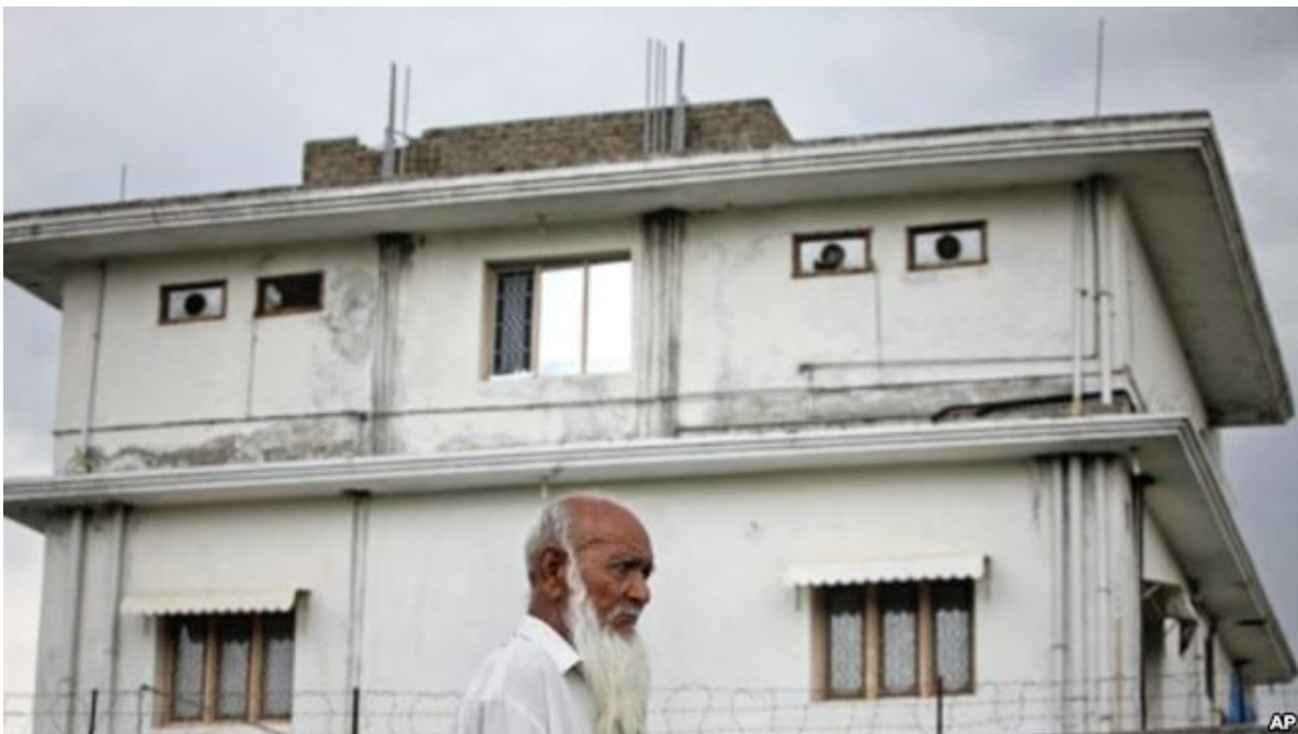
The Abbottabad Bin Laden compound, May 5, 2011 (3 days after Operation)

But when it comes to the actual military operation, the US could not have done it alone so deep into Pakistan's territory. Another factor which lends credence to this assumption is the deployment of Pakistan's army which secured all the roads and areas adjoining Bin Laden's compound on the night of the operation. It's a fact that Bin Laden was a high-value target but as was Khalid Sheikh Muhammad and scores of other al Qaeda militants who were apprehended by Pakistan's intelligence agencies and handed over to the US.