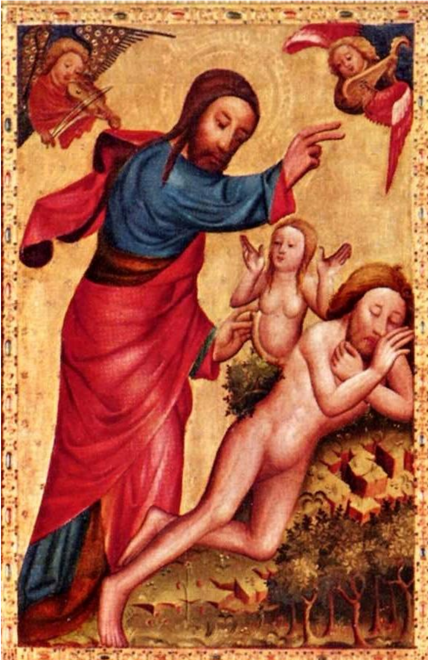
Adam 'gives birth' to Eve

"For man did not come from woman, but woman from man" (1 Corinthians 11:8)