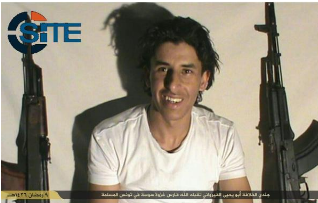
‘POSING WITH GUNS’ – Tunisian resort shooter Seifeddine Rezgui, pictured with the familiar SITE logo.