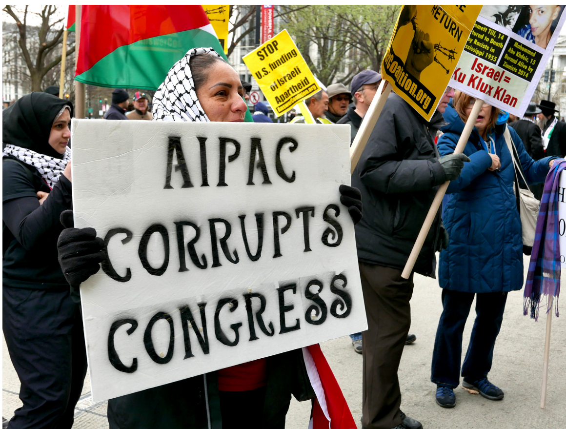
Outside annual AIPAC meeting in Washington, March 2016.

The lobby is no secret conspiracy. It is openly coordinated by AIPAC, which spreads billionaire donations throughout the U.S. political system and dictates the line to take on Israel to ensure a successful career.