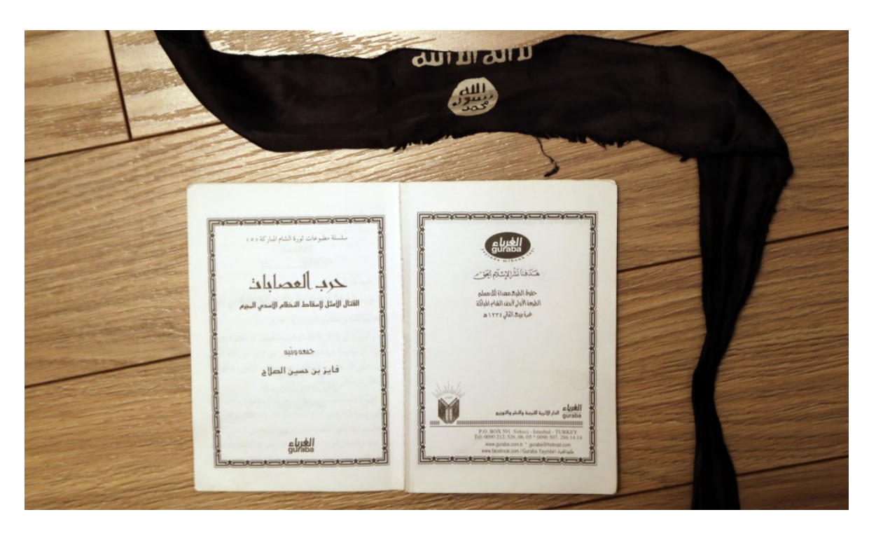
A suicide bomber's head-band and a manual, entitled "How to wage an ideal fight against the criminal Assad regime" found in an office of one of the Daesh jihadists in Shadadi.

The manual was found in one of the hospitals of Shadadi, which Daesh fighters kept holding even after the rest of the town was liberated.