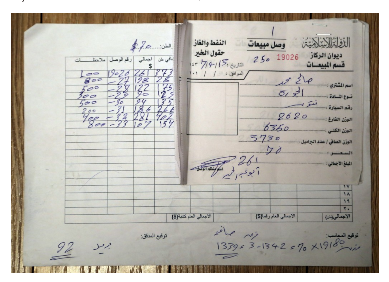
day 383 barrels were extracted and sold for $4979.

A document dated January 23, 2016, says that crude oil from Rijura well in the same oil field was sold at $70 per barrel, 19.18 tones were extracted, the daily revenue amounted to $1342.60.