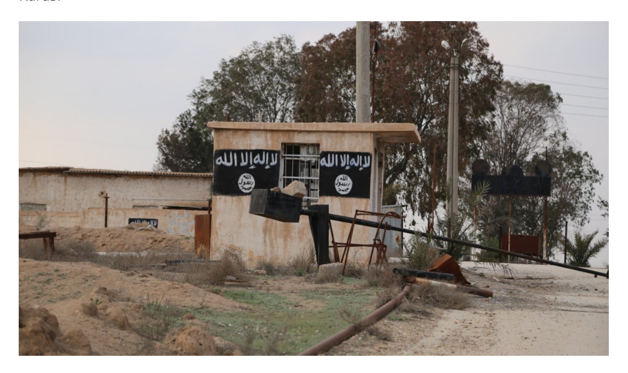
One of the buildings used earlier by Daesh

All the towns are located in an oil-rich area and were populated predominantly by the Syrian Kurds.