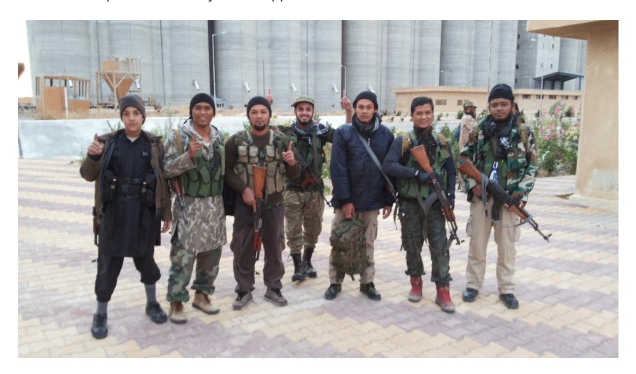
A picture of Daesh fighters taken from one of the captives.

The journalists interviewed the YPG fighters who liberated the area. Shadadi was freed in February 2016 and was the last town the Daesh group controlled in Syria's northeastern Hasakah province. The capture of the city closed off a key supply route for Daesh between Iraqi Mosul and Syrian Raqqa.