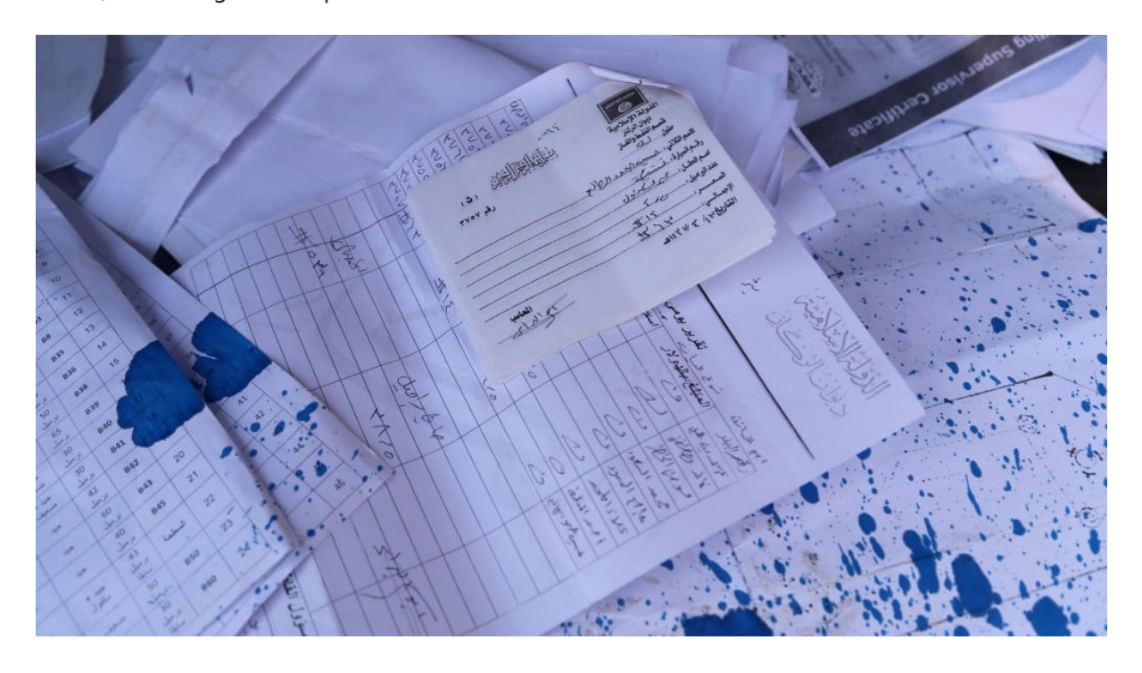
Financial records which detail the tracks of the illicit trade, revealing the scope and cost of the

What the crew has in its possession are financial records which detail the tracks of the illicit trade, revealing the scope and cost of the extracted oil.