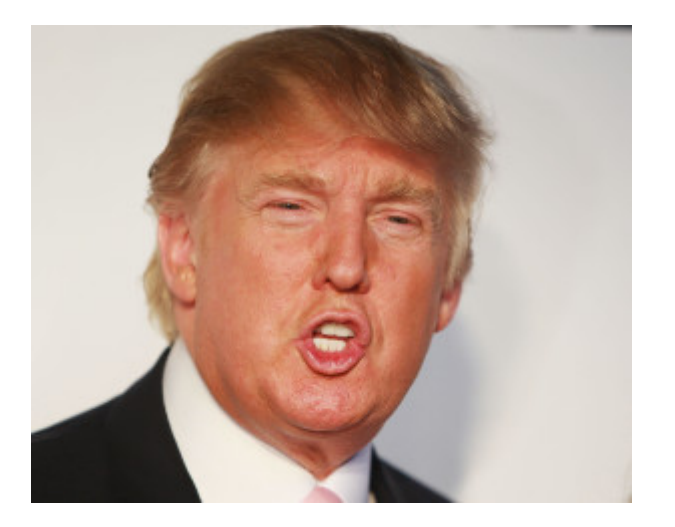
Republican presidential nominee Donald Trump.

So, when Donald Trump shows up in 2016 insisting that the electoral system is rigged against him, many Americans choose to believe his demagogy. But Trump isn't pressing for the full truth about the elections of 1968 or 1980 or 2000. He actually praises Republicans implicated in those cases and vows to appoint Supreme Court justices in the mold of the late Antonin Scalia.