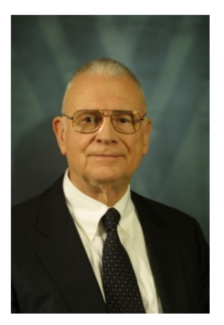
Former Rep. Lee Hamilton, D-Indiana.

But Bush's White House really had little to fear because whatever evidence that the congressional investigation received – and a great deal arrived in December 1992 and January 1993 – there was no stomach for actually proving that the 1980 Reagan campaign had conspired with Iranian radicals to extend the captivity of 52 Americans in order to ensure Reagan's election victory.