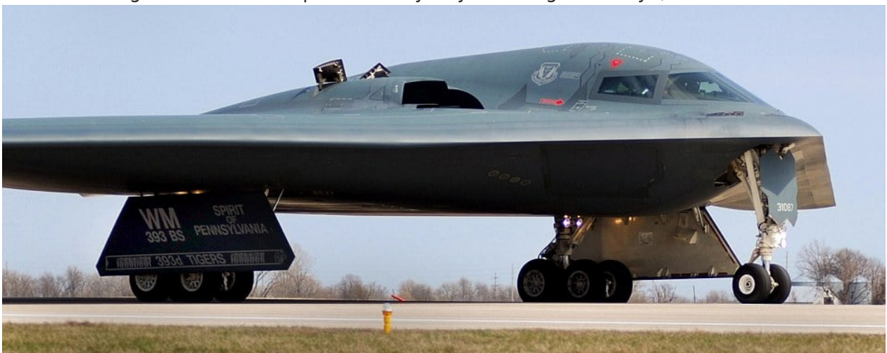
USAF Stealth B-2 Bomber used in Operation Odyssey Dawn

Pursuant to NATO's humanitarian mandate, we are informed by the media that these tens of thousands of strikes have not resulted in civilian casualties (with the exception of occasional "collateral damage").