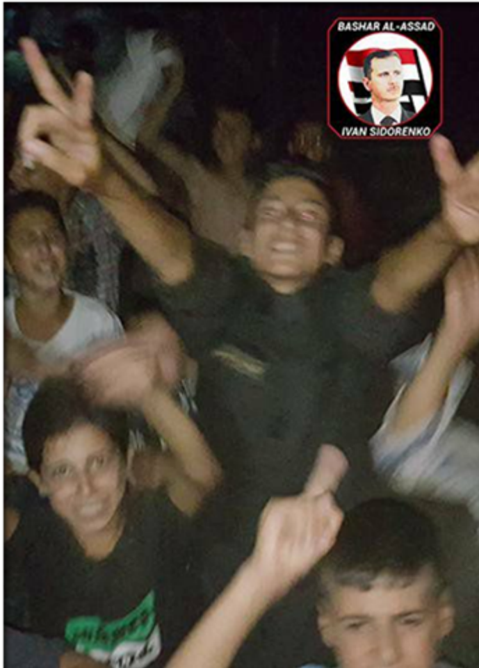
Celebrations as SAA breaks 4 year long Daesh siege.

Pictures and videos are emerging which show the jubilation of Syrians finally freed from their NATO terrorist captors, and their relief is palpable.