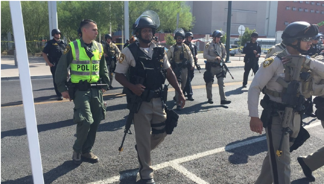
‘LIVE DRILL’ – Las Vegas has been at the forefront of active shooter training.

“MGM Resorts International, which owns the Mandalay Bay hotel near where the shooting occurred, fell 5.6 percent Monday. Wynn Resorts slipped 1.2 percent. Las Vegas Sands fell as much as 2.1 percent before closing higher.”