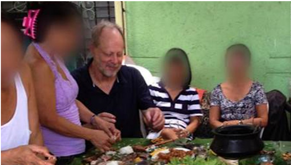
‘WORLD TRAVELER’ -Paddock on an overseas trip believed to be the Philippines in April of 2013.