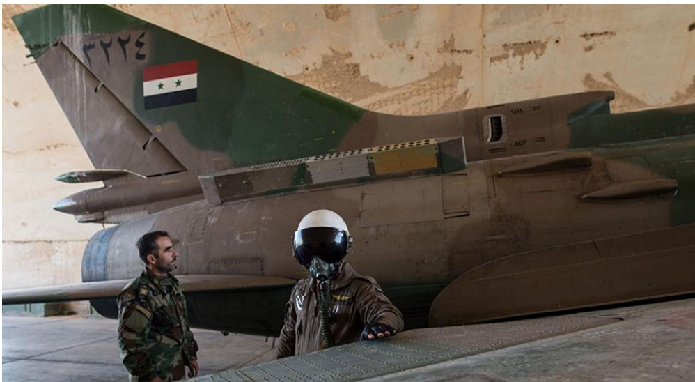
The fin and rear fuselage of a Syrian Airforce Su-22M, The same type of aircraft shot down by US forces while engaging ISIS targets fleeing Raqqa, Syria.

The Syrian Army General Command responded with an official statement that the flagrant aggression undoubtedly affirms the US’s real stance in support of terrorism which aims to affect the capability of the Syrian Arab Army- the only active force- along with its allies that practice its legitimate right in combating terrorism all over Syria.