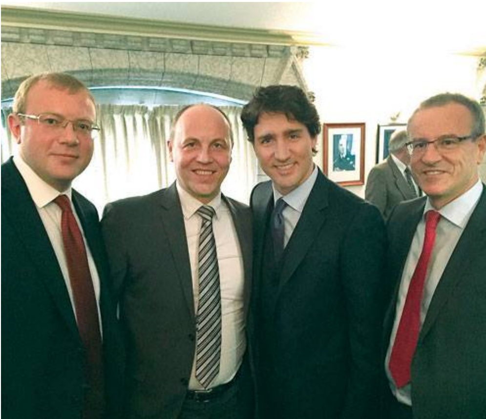
Parubiy with Canada's Prime minister Justin Trudeau, 2016