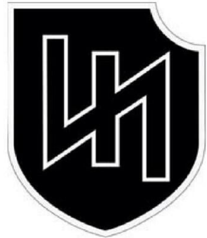
Emblem of the SS Division Das Reich.

These militia bearing the Nazi SS emblem are sponsored by Ukraine's Ministry of Internal Affairs, equivalent to America's Department of Homeland Security.