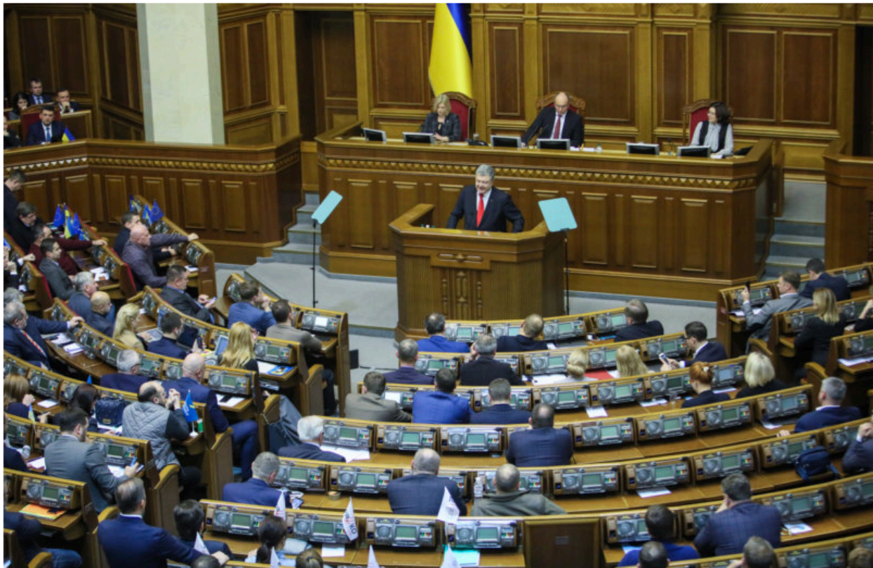
📺 Ukraine's President Petro Poroshenko speaks during an emergency session regarding declaration of martial law in Ukraine on Nov. 26, 2018.