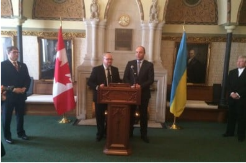
Parubiy received by the Canadian Parliament