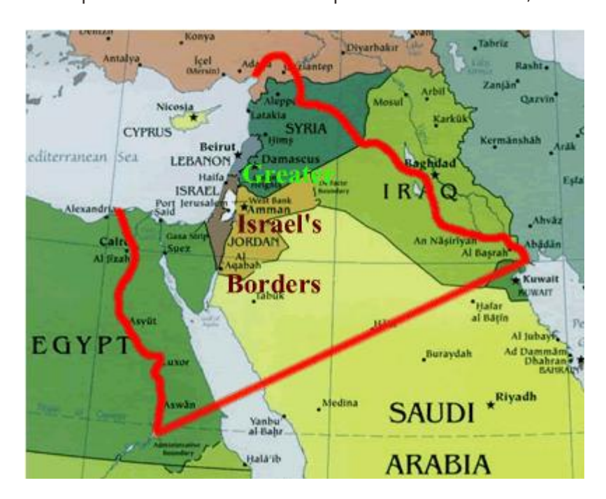
Greater Israel" requires the breaking up of the existing Arab states into small states.

Then came the dispute with Kuwait over alleged oil theft and Dinar destabilizing with the then US Ambassador April Glaspie personally giving Saddam Hussein the green light to invade should he choose. The subsequent nation paralyzing UN embargo followed, then the 2003 decimation and occupation – another orchestrated downward spiral – and tragedy and now open talk of what has been planned for decades, the break up of Iraq.