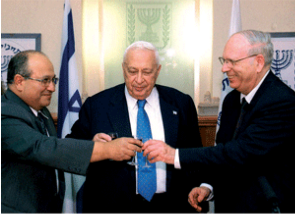
From Left to Right: Dagan, Sharon, Halevy

The Dagan Plan has established continuity in the military-intelligence agenda. In the wake of the 2000 elections, Meir Dagan was assigned a key role. “He became Sharon’s “go-between” in security issues with President’s Bush’s special envoys Zinni and Mitchell.” He was subsequently appointed Director of the Mossad by Prime Minister Ariel Sharon in August 2002. In the post-Sharon period, he remained head of Mossad. He was reconfirmed in his position as Director of Israeli Intelligence by Prime Minister Ehud Olmert in June 2008.