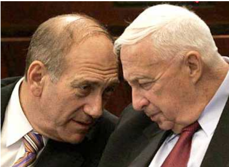
Olmert and Sharon

It is important to focus on a number of key events which have led up to the killings in Gaza under “Operation Cast Lead”: