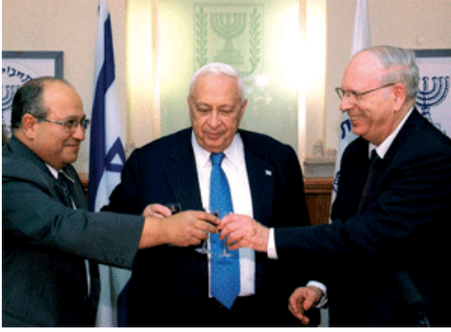
From Left to Right: Dagan, Sharon, Halevy

The Dagan Plan has established continuity in the military-intelligence agenda. In the wake of the 2000 elections, Meir Dagan was assigned a key role. “He became Sharon’s “go-between” in security issues with President’s Bush’s special envoys Zinni and Mitchell.” He was subsequently appointed Director of the Mossad by Prime Minister Ariel Sharon in August 2002. In the post-Sharon period, he remained head of Mossad. He was reconfirmed in his position as Director of Israeli Intelligence by Prime Minister Ehud Olmert in June 2008.