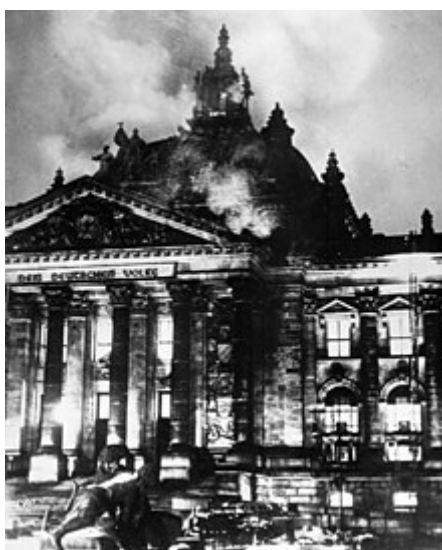
The Reichstag Fire, Berlin, February 1933

The following year, upon the death of president Hindenburg in 1934, Hitler “declared the office of President vacant” and took over as Fuerer , the combined function’s of Chancellor and Head of State.