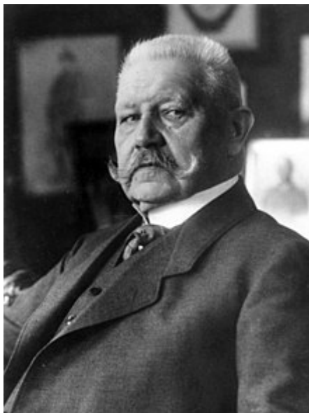
Germany's President (Field Marshal) Paul von Hindenburg