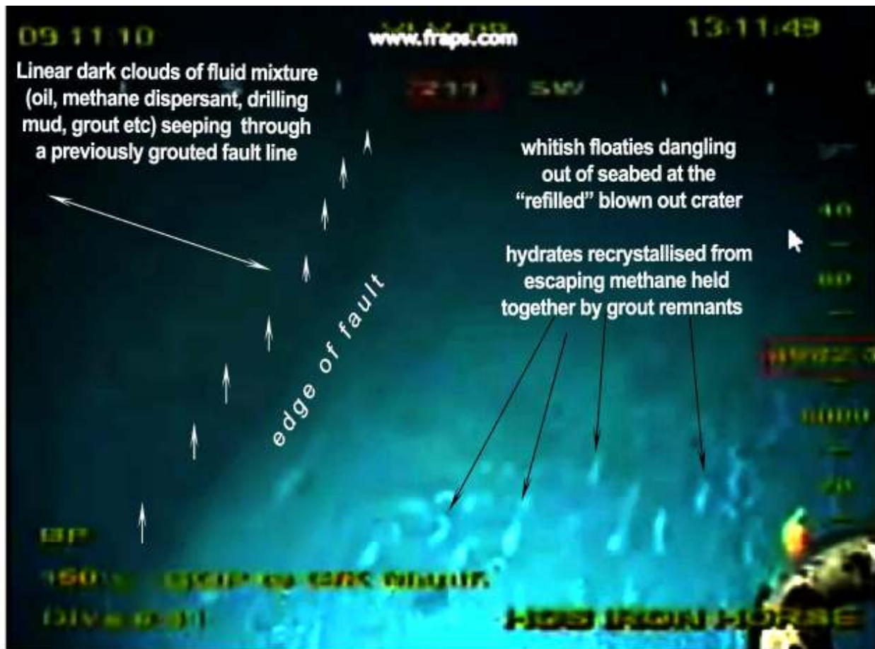
136-3 The latest image (9 Nov10) in the vicinity of Well A location, after the last pumping of cement. After each attempt to grout and contain the escaping gas and oil, the monster oil-gas leak comes back even stronger. A clear evidence that BP had failed to contain the monster oil-gas leak is strewn all over the seafloor.