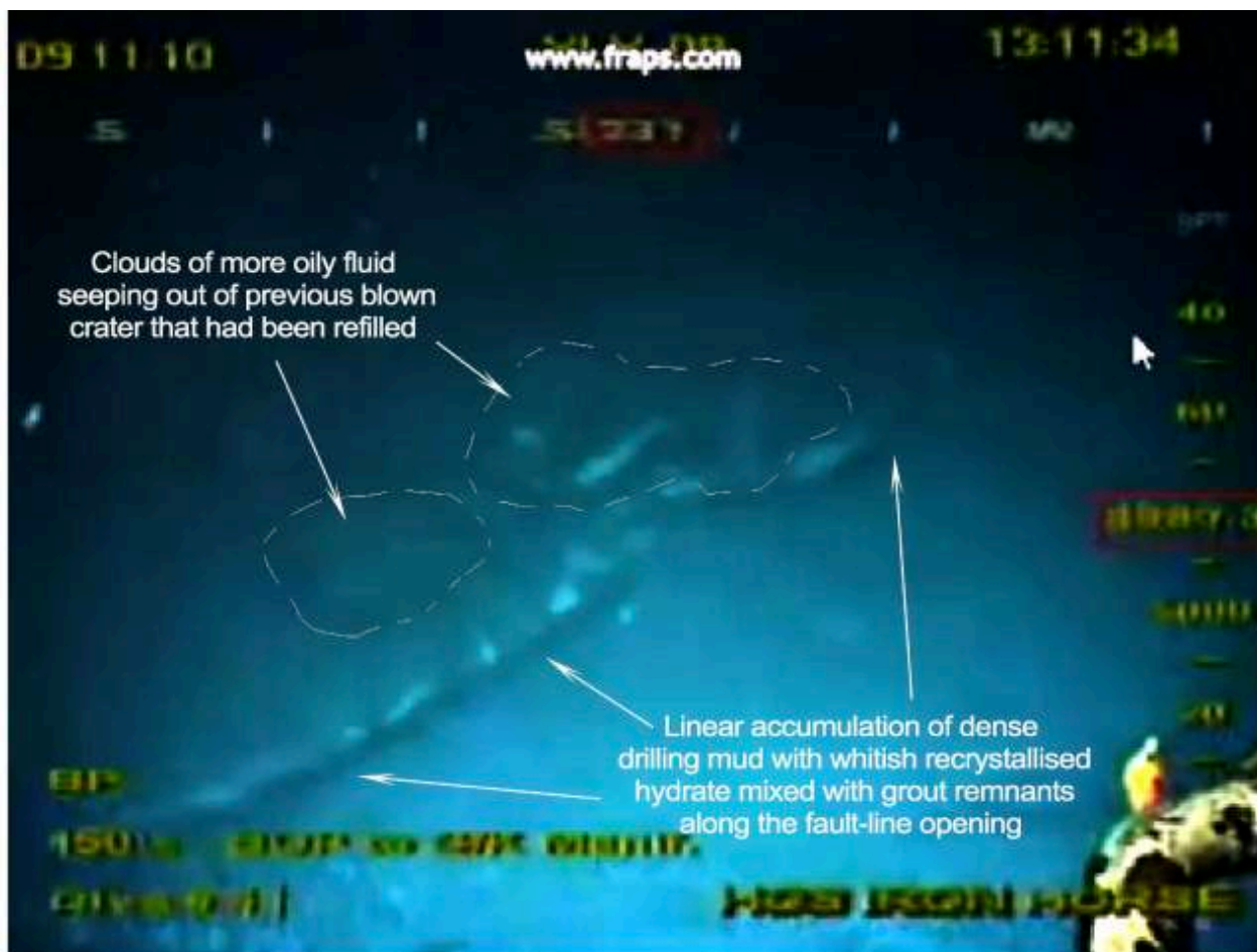
Fig 137-01 Fault line near to well A. Note the gas-oil fluid seeping out in a straight line dictated by the underlying fault, forming re-crystallized hydrates mixed with mud and grout remnants. More oil (cloudy appearance) is seeping out of the re-filled blown up crater.

When you factor in this constant vaporization of methane hydrates/clathrates both sub-seafloor as well as those scattered around the seafloor surface to the existing scenario, this devolving situation becomes that much more difficult to effectively remedy. With the resulting shifts and resettling and reconfiguration of the entire seafloor terrain and underlying strata occurring in the wake of these dynamics, we are left with a situation that is not going to get better through the use of even more invasive technology and intrusive machinery.