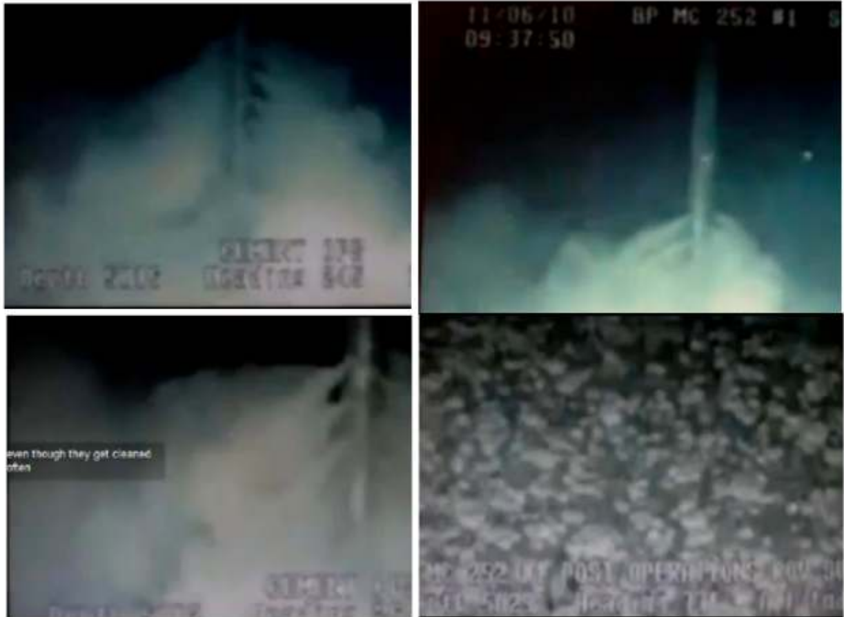
Fig 137-06 Chemical Spraying caught on camera – disguised as Post Operation, Rig Move and Cement Ops. Picture bottom right shows the hydrate ice forming at the seabed below.

The pictorial evidence tells the whole story.