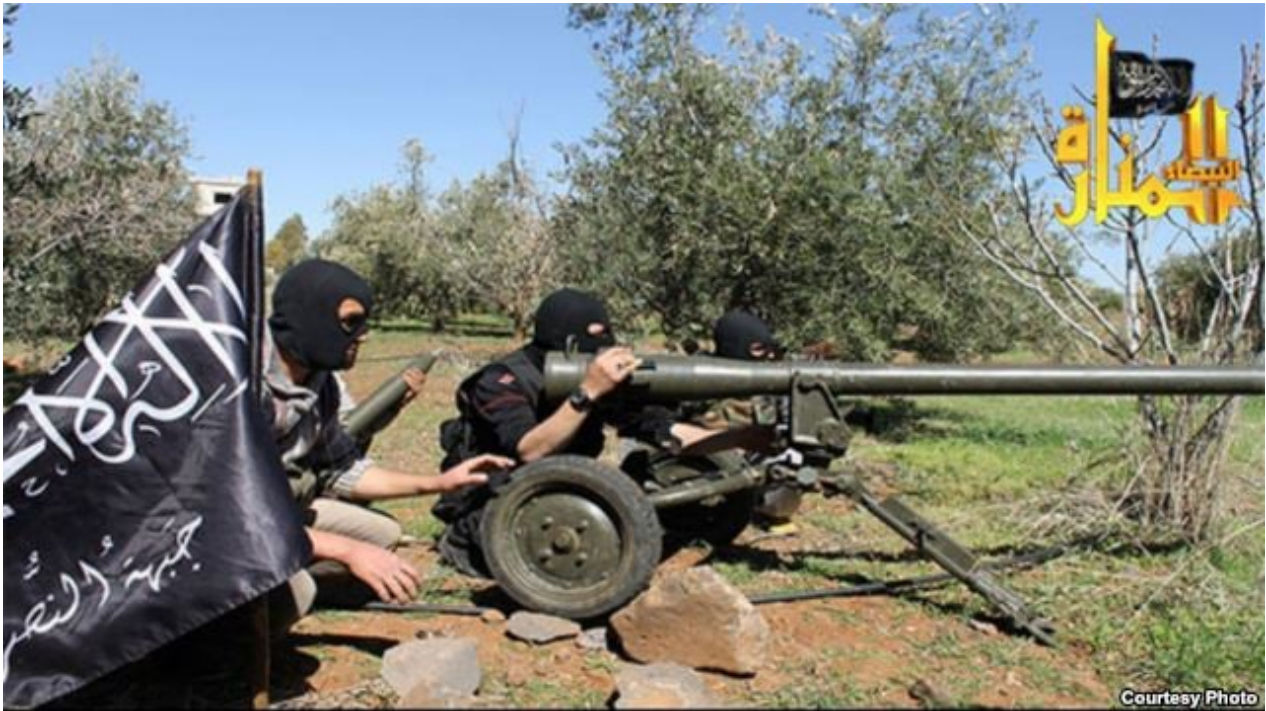
Al Nusrah Front “Freedom fighters”

The Obama administration is in an impasse: its foot soldiers have been defeated. A “no fly zone” would, at this stage, be a risky proposition given Syria’s air defense system, which includes the Russian S-300 SAM system.