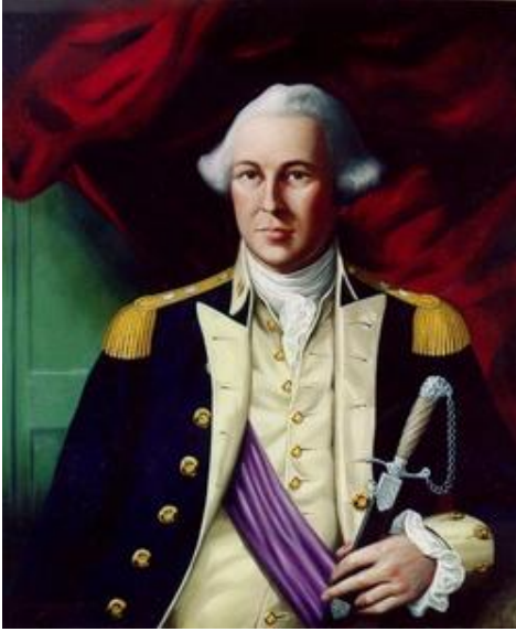
General Joseph Warren

All US Masonic lodges are to this day warranted by the British Crown, whom they serve as a global intelligence and counterrevolutionary subversion network.