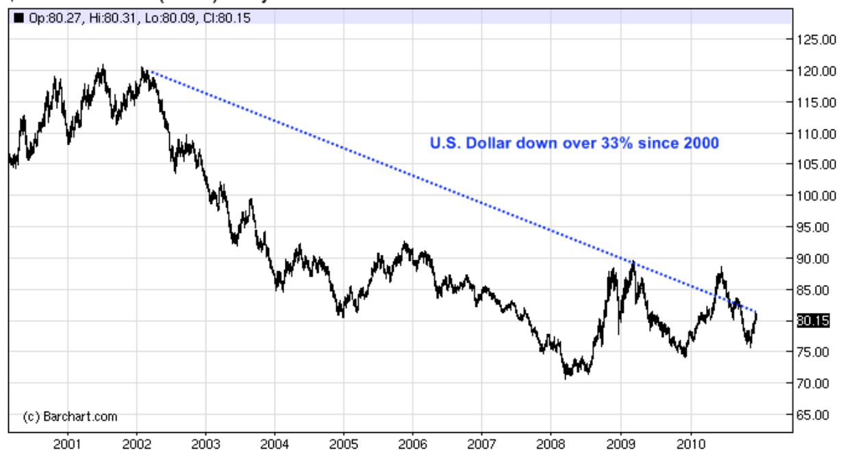
$DXY - Dollar Index (INDEX) - Daily OHLC Chart

Senator Sanders is absolutely right. Did you also know that billions of dollars went to foreign central banks as well? We all know the issues going on with the European Zone today but the Fed never mentioned this during the bailout frenzy. Don't be fooled when the Fed says there is no cost associated. 26 million Americans are unemployed or underemployed and 44 million Americans are on food assistance. The US dollar has done the following in the last decade: