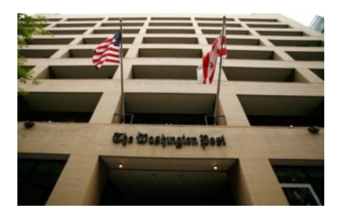
The Washington Post building in downtown Washington, D.C.

But the mainstream media stars didn't like it when Trump began throwing the "fake news" slur back at them. Thus, the First Amendment lapel pins and the standing ovation for Jeff Mason's repudiation of the "fake news" label.