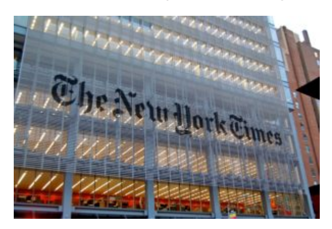
New York Times building in New York City.

establishment. For instance, The New York Times' Pentagon correspondent <u>Michael R. Gordon</u>, who was the lead writer on the infamous "aluminum tubes for nuclear centrifuges" story which got the ball rolling for the Bush administration's rollout of its invade-Iraq advertising campaign in September 2002, still covers national security for the Times – and still serves as a conveyor belt for U.S. government propaganda.