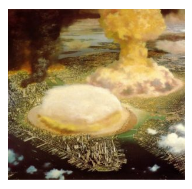
Illustration by Chesley Bonestell of nuclear bombs detonating over New York City, entitled "Hiroshima U.S.A." Colliers, Aug. 5, 1950.

The existential issue before us is whether – blinded by propaganda and disinformation – we will stumble into a nuclear conflict between superpowers that could exterminate all life on earth or perhaps leave behind a radiated hulk of a planet suitable only for cockroaches and other hardy life forms.