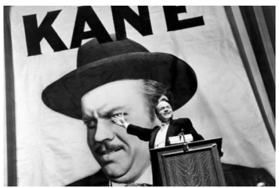
Orson Wells as Citizen Kane (1941)

In our day, a similar hoax still reigns, as mainstream media is literally as credible as Weekly World News ' Bat Boy story.