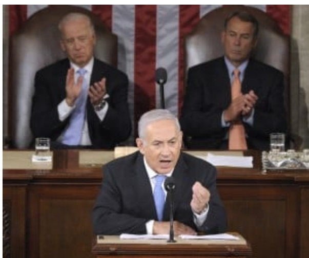
Benjamin Netanyahu, Joe Biden, John Boehner, 2011

Apart from small extremist rightwing sects who exhibit visceral anti-Semitism and denigrate everything Jewish, there are very few academics and politicians willing to question this supremacist doctrine. On the contrary, there is an incurable tendency to advance oneself by accepting and embellishing on it.