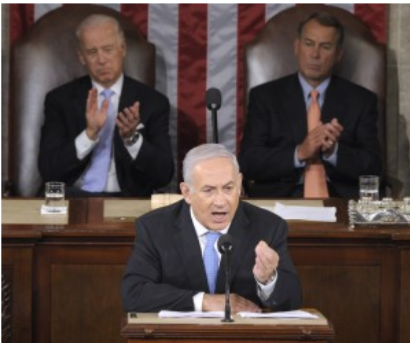
Benjamin Netanyahu, Joe Biden, John Boehner, 2011

Apart from small extremist rightwing sects who exhibit visceral anti-Semitism and denigrate everything Jewish, there are very few academics and politicians willing to question this supremacist doctrine. On the contrary, there is an incurable tendency to advance oneself by accepting and embellishing on it.