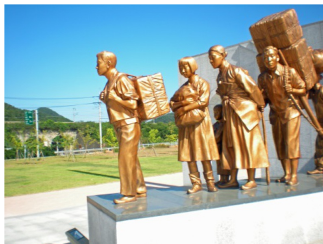
Refugee tableau at the No Gun Ri Peace Park

But the memory divide—East and West—can only grow. In the United States, the Korean feature film, A Small Pond , found no distributor. The graphic narrative, though translated into French and Italian, has not been published in English. Kill 'Em All , a hard-hitting BBC documentary on No Gun Ri, aired in Britain in prime time yet was shunned in America. 22 Two years after the Army's deceitful report, a Pentagon-affiliated publisher issued an Army apologist's polemic on No Gun Ri, an often-incoherent book packed with disinformation. 23 In the English-language Wikipedia, the "No Gun Ri Massacre" article became a Wikipedic free-for-all between jingoistic denialists and the truth. Finally, ironically around the time the Korean park was opened in 2011, the U.S. Defense Department purged from its website the Army's investigative report, further pushing No Gun Ri toward official oblivion.