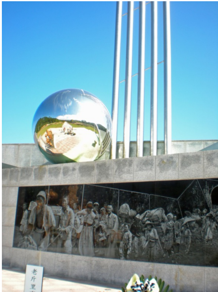
No Gun Ri Peace Park memorial tower (Photo: