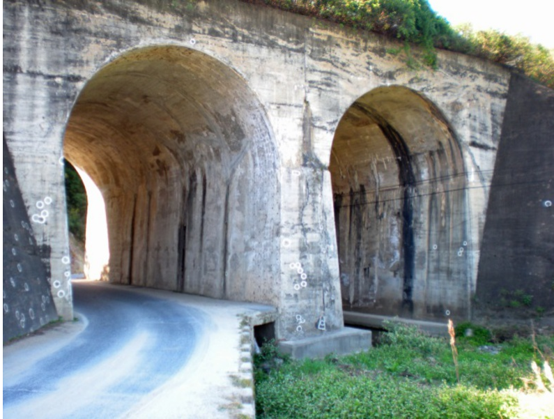
The No Gun Ri railroad bridge, site of the 1950 refugee massacre.

Visitors (an estimated 120,000 came in 2014) will find the warning words of Ambassador Muccio and Colonel Rogers behind the museum's glass display cases, along with numerous "shoot refugees" orders. A diorama depicts the unfolding events of late July 1950. One wall bears the names of No Gun Ri's dead. The truths of No Gun Ri can be found as well in nearby towns and villages, home of survivors who have testified to what happened, of a man whose face was shredded by bullets as a boy at No Gun Ri, a woman whose eye was blown out, others living with the legacy of livid scars, dents in their flesh and in their psyches. Elsewhere in South Korea, others have also worked to embed No Gun Ri in the national memory, producing a major studio's feature film, a superbly drawn, two-volume graphic narrative, and an award-winning three-part television documentary. 20