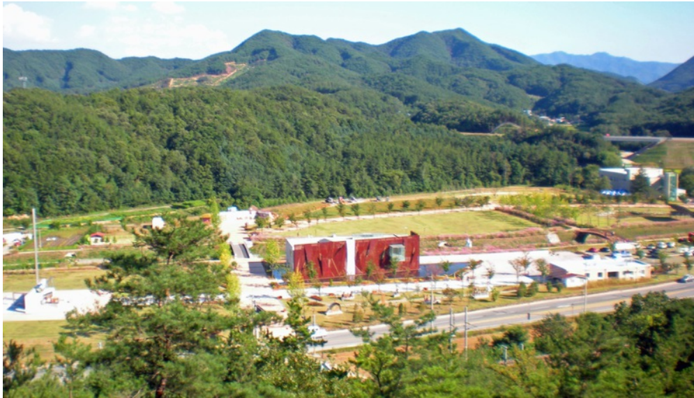
The No Gun Ri Peace Park, with its memorial tower on the left, museum in the center and education (conference) building at the upper right. The railroad bridge massacre site is out of the frame on the lower left.

In the 15 years since the world first learned of this mass killing, it has become increasingly clear that the U.S. Army's 1999-2001 investigation of No Gun Ri suppressed vital documents and testimony, as it strove to exonerate itself of culpability and liability, and to declare – with an inexplicable choice of words – that the four-day bloodbath was “not deliberate.” 2