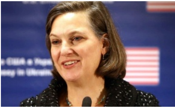
Assistant Secretary of State for European and Eurasian Affairs Victoria Nuland during a press conference at the U.S. Embassy in Kiev, Ukraine, on Feb. 7, 2014.

But Assistant Secretary Nuland, working with Prime Minister Yatsenyuk and the Ukrainian parliament, sabotaged the agreement by requiring the Donbass rebels to first surrender which they were unwilling to do, having no faith in the sincerity of the Kiev regime to live up to its commitment to grant limited autonomy to the Donbass.