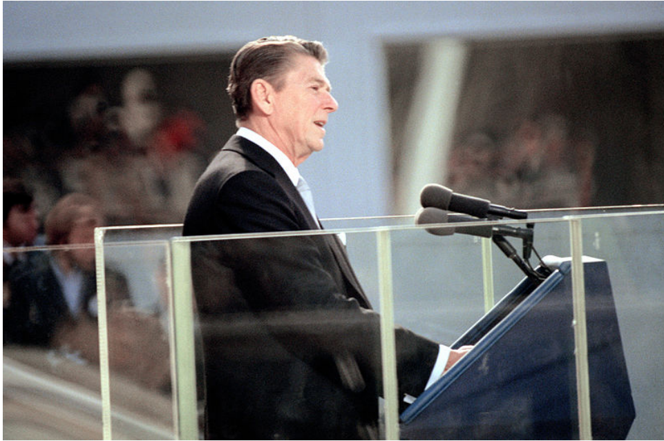
President Ronald Reagan, delivering his Inaugural Address on Jan. 20, 1981.

The key difference is that Iran-Contra was an unconstitutional effort by the Reagan administration to finance an illegal war against Nicaragua's Sandinista government in defiance of a congressional ban. The Trump-connected communications with Russians – to the degree they have occurred – appear to have been aimed at preventing a new and dangerous Cold War that could lead to a nuclear holocaust.