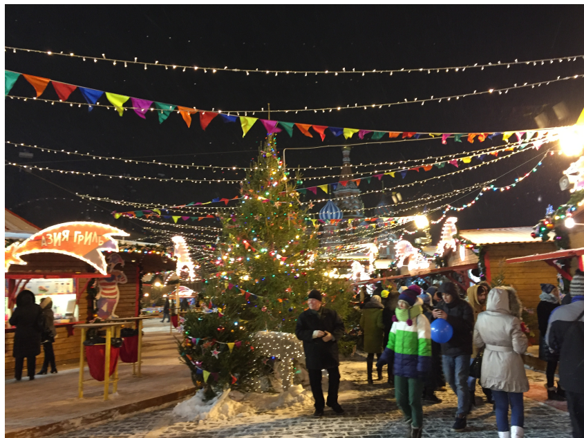
Wintery scene at Red Square in Moscow, Dec. 6, 2016.

Since last November's election, this New McCarthyism has merged with hatred toward Donald Trump, especially after the outgoing Obama administration lodged unproven accusations that Russia undercut Hillary Clinton's campaign by hacking into the emails of the Democratic National Committee and those of her campaign chairman John Podesta – and slipped that information to WikiLeaks.