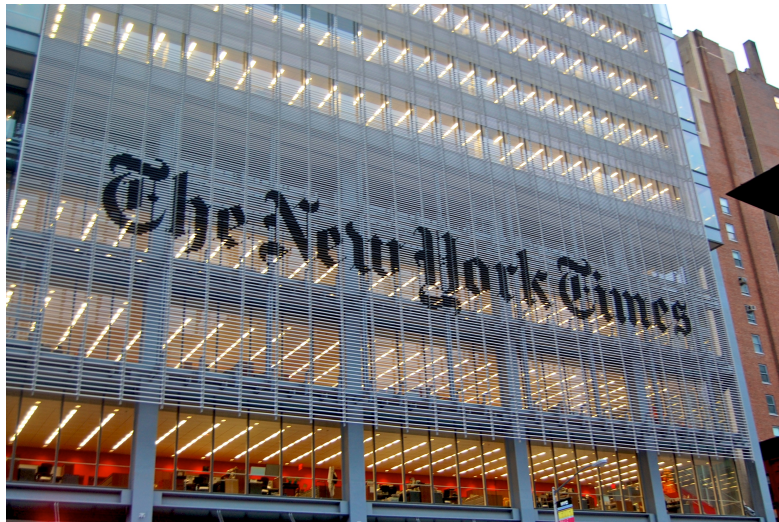
New York Times building in New York City.

The New York Times joined in the frenzy by calling for leading technology companies to marginalize Web sites that are deemed to be publishing “fake news,” a vague term that was applied not just to intentionally false stories but to information that questioned official narratives, no matter how dubious those narratives were. The New McCarthyism was morphing into a New Orwellianism .