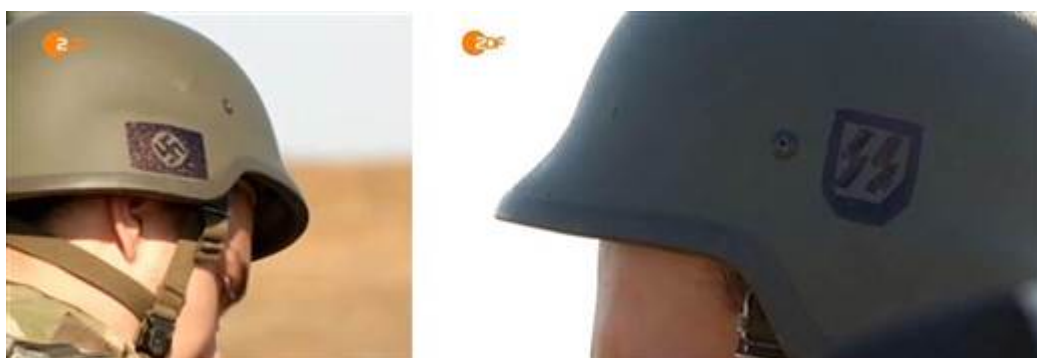
Nazi symbols on helmets worn by members of Ukraine's Azov battalion. (As filmed by a Norwegian film crew and shown on German TV)

In the ensuing days, the right-wing violence spread beyond Kiev, prompting Crimea's legislature to propose secession from Ukraine and readmission to Russia, whose relationship to the peninsula dated back to Catherine the Great.