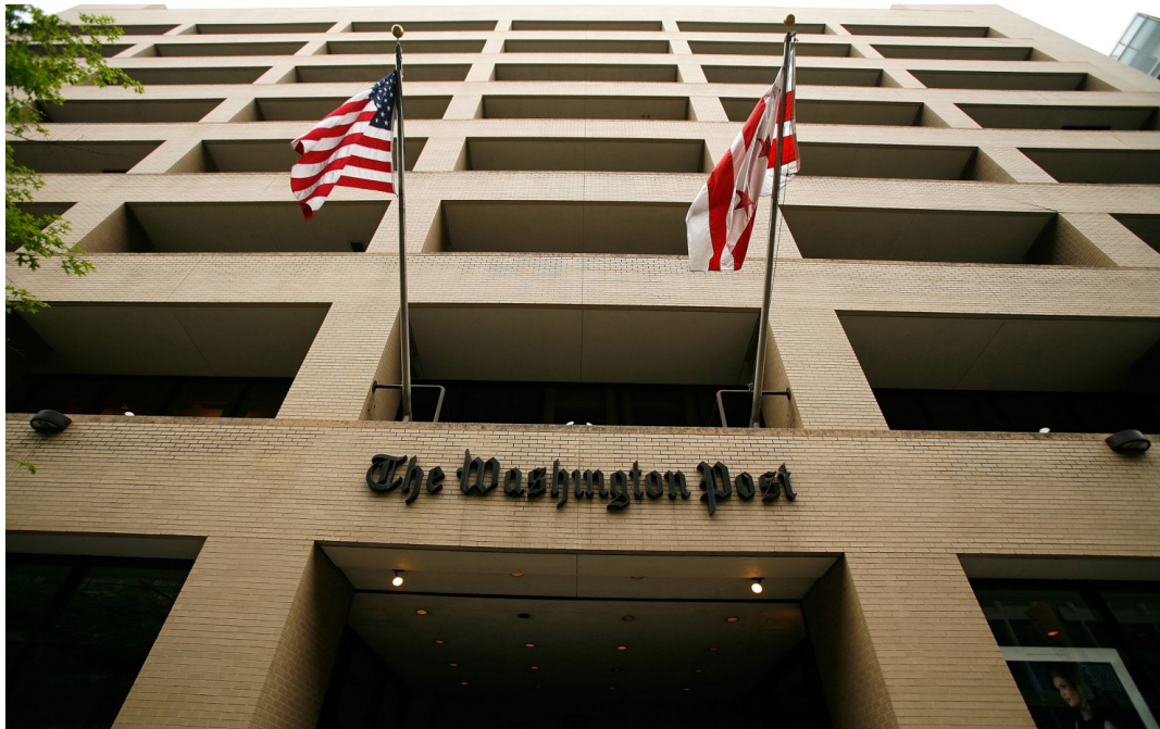
The Washington Post building in downtown Washington, D.C.