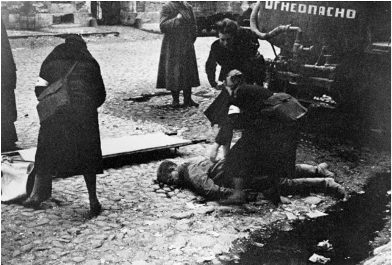
Nurses assisting the wounded during the first bombardment