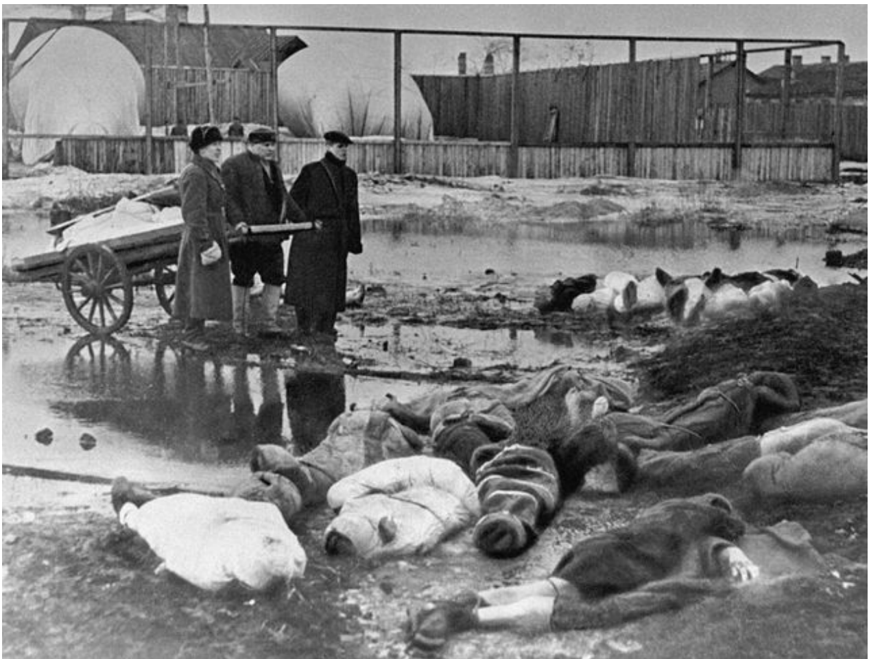
The Volkovo cemetery

“I am still alive and able to write in my diary. I’m no longer convinced at all that Leningrad won’t be abandoned. So much has been said, we’ve heard so many fine words and speeches: Kiev and Leningrad are impregnable fortresses!!!... Never will a fascist set foot in the flourishing capital of the Ukraine, never will he be able to enter our country’s northern pearl, Leningrad. But today it was reported on the radio ... after several days of bitter fighting our army ... withdrew from Kiev! What does this mean? No one can understand it.” [pp. 115-16]