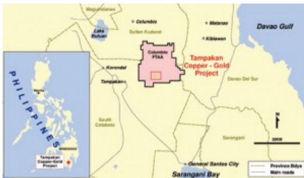
Tampakan Mining

mining bewail the loss of their former livelihood in fishing, agriculture and forestry, “as some of them were forced to become mineworkers instead, or service workers for those at work in the mines, including some women becoming prostitutes, reportedly driven to it by the combination of their family’s loss of land, livelihood and influx of men working in the mines” (Salamat, 2013).