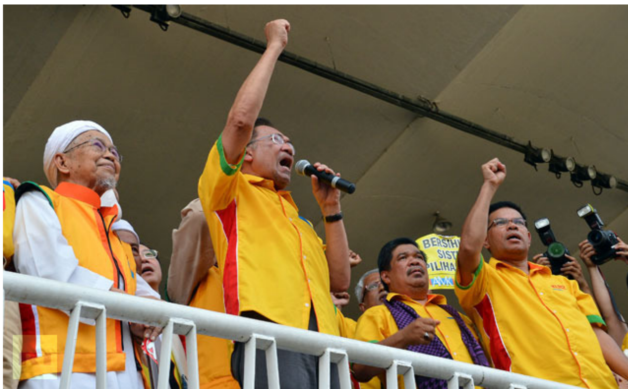
Despite Bersih’s best efforts to portray itself as apolitical, it is clearly led for and by Malaysia’s US-backed opposition, with the IMF’s Anwar Ibrahim leading the coalition. Here, Anwar Ibrahim (center) can be seen speaking to a Bersih rally in Malaysia.

“He and other Australian MPs were to meet opposition leader Anwar Ibrahim, as well as Malaysia’s minister in charge of parliamentary affairs, Mohammed Nazri, and members of the group Bersih, the Coalition for Clean and Fair Elections.”