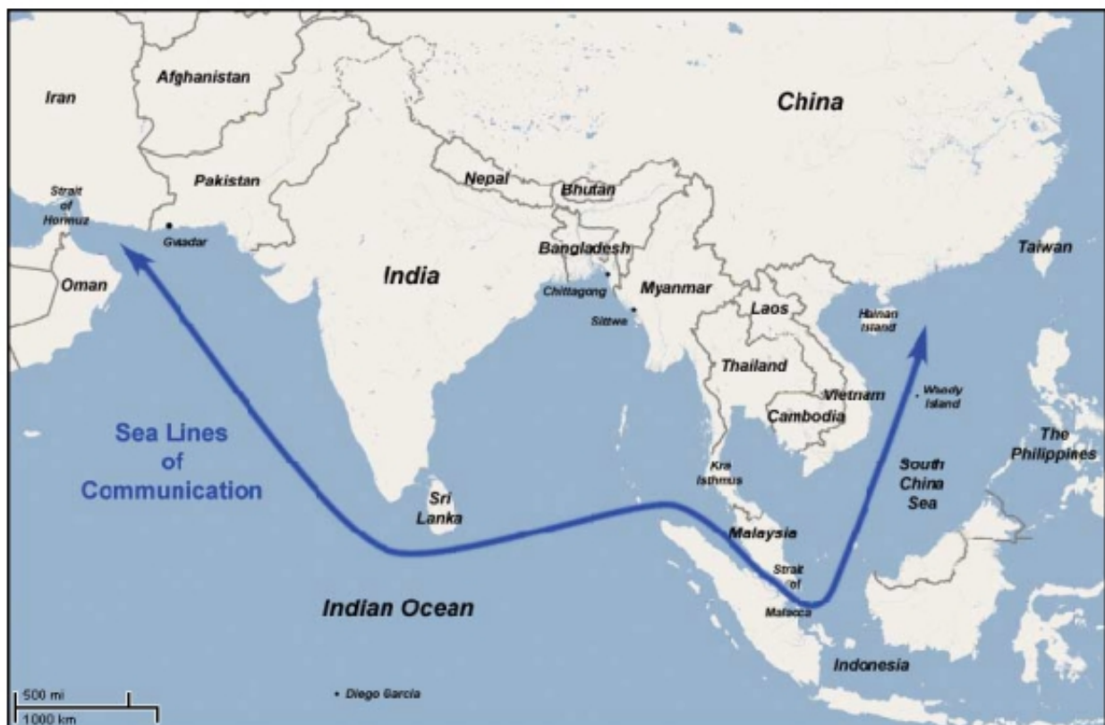
Image: Figure 1. From SSI's 2006 "String of Pearls" report detailing a strategy of containment for China. While "democracy," "freedom," and "human rights" will mask the ascension of Western aligned client regimes into power, it is part of a region-wide campaign to overthrow nationalist elements and install client regimes in order to encircle and contain China . Violence in areas like Sittwe, Rakhine Myanmar, or Gwadar Baluchistan Pakistan,

With articles like " The Redirection " by Pulitzer Prize-winning journalist Seymour Hersh in the New Yorker, and the Wall Street Journal's " To Check Syria, U.S. Explores Bond With Muslim Brothers " as far back as 2007 revealing that the West was planning to put armed extremists in power across the Arab World, it is clear that the terrorism and despotism now unfolding across the Arab World is not an unintended consequence, but a long premeditated conspiracy unfolding as planned. Similar plans to use faux-democracy movements and even violence in Southeast Asia to serve as cover for Western instigated regime change has also been well documented in Malaysia as well as Myanmar and neighboring Thailand . Plans to use Southeast Asia against China have been documented as far back as the late 1990's .