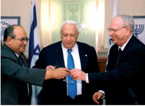
From Left to Right: Dagan, Sharon, Halevy

The Dagan Plan has established continuity in the military-intelligence agenda. In the wake of the 2000 elections, Meir Dagan was assigned a key role. “He became Sharon’s “go-between” in security issues with President’s Bush’s special envoys Zinni and Mitchell.” He was subsequently appointed Director of the Mossad by Prime Minister Ariel Sharon in August 2002. In the post-Sharon period, he remained head of Mossad. He was reconfirmed in his position as Director of Israeli Intelligence by Prime Minister Ehud Olmert in June 2008.