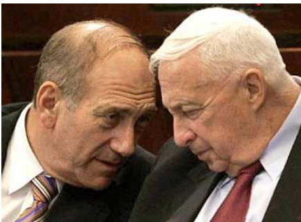
Olmert and Sharon

It is important to focus on a number of key events from the 2001 Dagan Plan to the killings in Gaza under “Operation Cast Lead” in 2008-2009 and “Operation Protective Edge” in 2014 leading up to the Gaza massacres of March-May 2018.