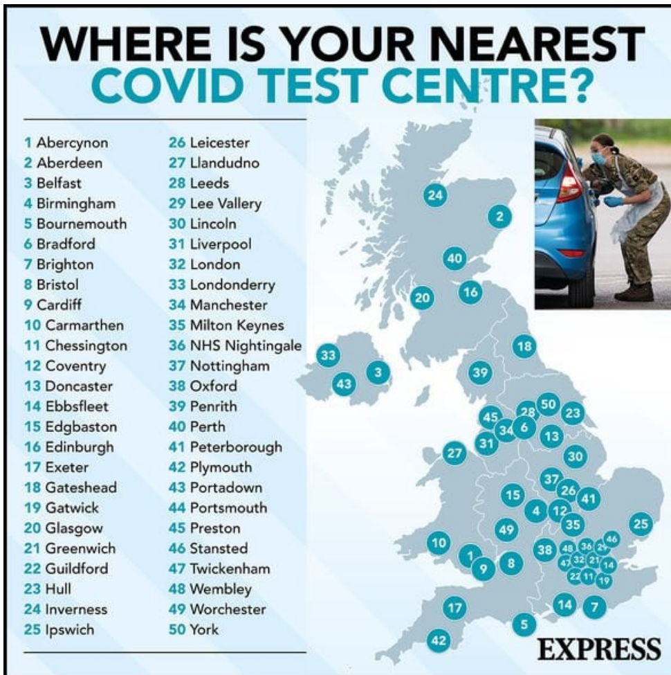
Screenshot, Daily Express

Panic prevails. national authorities establish testing facilities, do it yourself testing kits, etc.