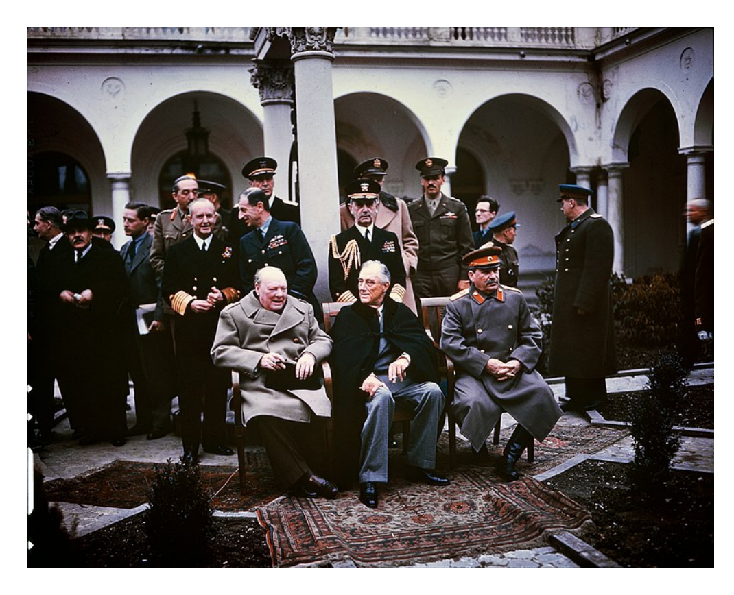
The "Big Three" at the Yalta Conference: <u>Winston Churchill</u>, <u>Franklin D. Roosevelt</u> and <u>Joseph Stalin</u>, 1945.