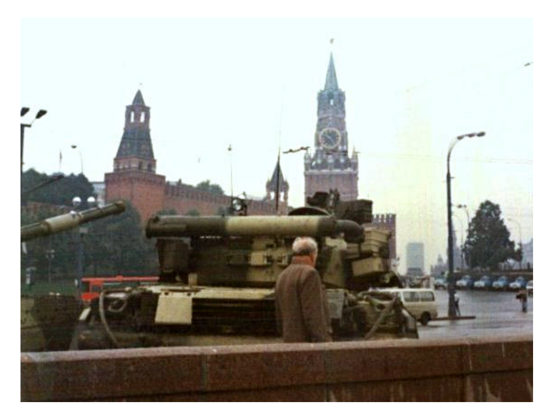
Tanks in <u>Red Square</u> during the <u>August Coup</u>, four months before the <u>USSR</u> will be dissolved, 1991.

huge portion of Russian territory. Encircled and invaded on every side amazingly the communists were victorious and regained control of most of their territory. It was one of the most glorious victories in human history.