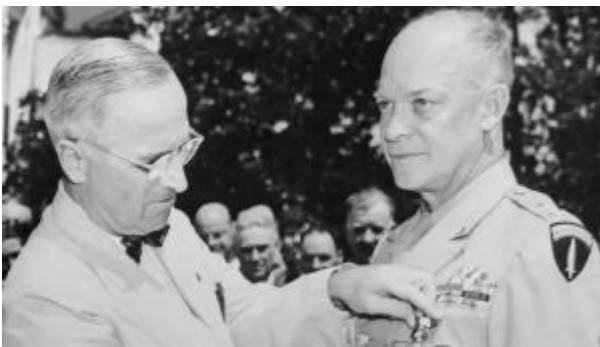
Harry Truman and Dwight Eisenhower

They massacred refugees fleeing south since they worried some of them might be communists. The Americans continued their war on the South Koreans throughout the war and in reality it continues to this day. Using their Naval superiority MacArthur staged a landing at the Port of Inchon leveling the city and unleashing Rhee's troops and fascist death squads on the survivors. The North Korean army was forced to retreat or risk being cut off. Now the UN forces decided to invade North Korea and reunify the whole country under Rhee's dictatorship. They advanced steadily but the North Korean forces were actually regrouping far to the North as well as setting up a guerrilla army behind UN lines. MacArthur was deliberately attempting to provoke the Chinese he hoped to expand the war into China. He hoped that backed up by a nuclear attack on China Chiang would be able to retake China. He even went so far as to conceal a Chinese counter attack and lie to Truman personally afterwards claiming he believed China would not enter the war when they already had.