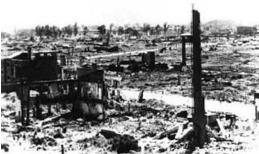
Pyongyang in Rubble (1953)

The “loss” of China would lead the next year to a massive escalation of the war in Korea. Most people believe that the Korean War began in 1950 when North Korea invaded South Korea. This is another example of cold war propaganda becoming enshrined in mainstream history. In reality South Korea (spurred on by the Dulles brothers, General Macarthur and the China Lobby) probably attacked North Korea in 1950 provoking a North Korean counter attack. South Korea had been launching military offensives against North Korea aimed at seizing a foothold and also sending small bands of terrorists to wreak havoc.