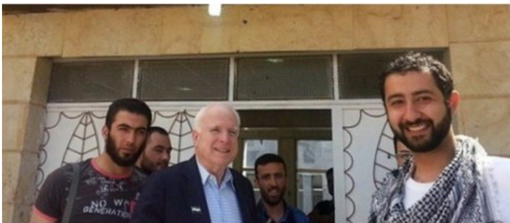
Friends in low