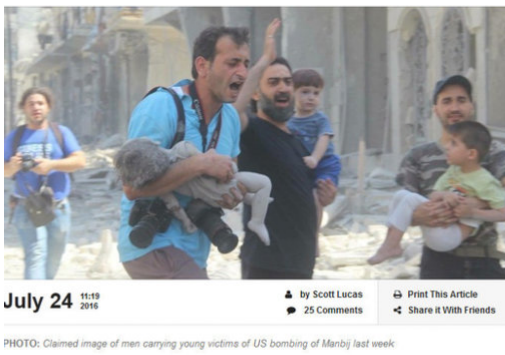
Aftermath of US bombing of Manbij last month

Recognizing a propaganda opportunity when they see one, within hours most Western media outlets had headlined the image along with emotionally-manipulative screeds penned by media hacks who couldn't care less about Omran or Syria. When the US military killed 73 civilians in Syria last month , images of the carnage, like the one below, didn't make the cut, for some strange reason.