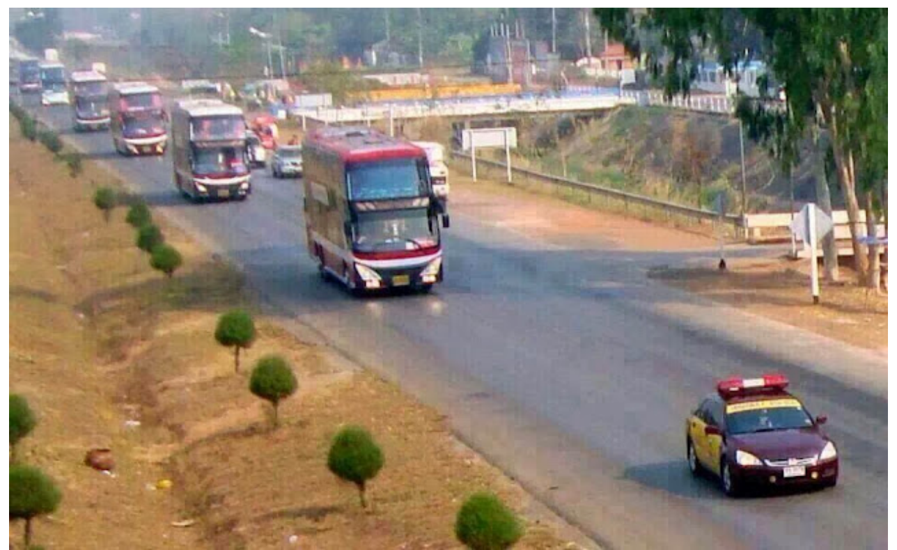
Image: <u>Astroturf – by the bus load</u>. Last November, the fumbling regime resorted to busing in supporters to counter unprecedented numbers of protesters in the streets demanding an end to the <u>Wall Street-backed Shinawatra regime</u>. State resources, including an extensive police escort, were spent in an attempt to bolster the illusion that the current regime has the people's backing – a page out of the old tattered playbook of despots everywhere. Not long after, violence predictably erupted.