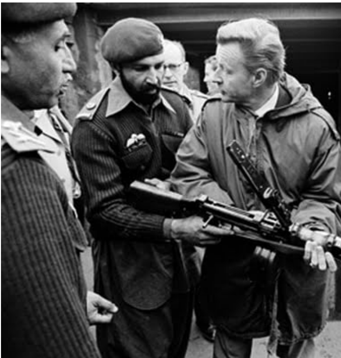
Osama bin Laden with President Carter's National Security Advisor Zbigniew Brzezinski

1996: The Saudi Arabian government is financially supporting Osama bin Laden's Al Qaeda and other extremist groups. After 9/11, the Bush Administration does nothing to confront the Saudi leadership over its support of terror organizations and its refusal to help in the investigation. [ New Yorker, 10/22/01 , more ]