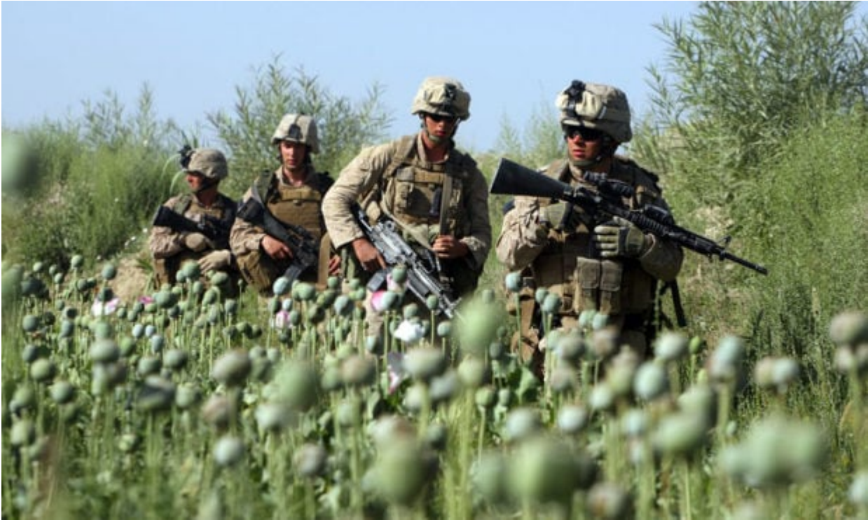
Troops in Afghanistan's Opium Fields

droughts reduced Afghanistan's opium yield by 91% in 2001. Yet the UN expects its 2002 opium crop to be equivalent to the bumper one of three years ago. Afghanistan is the source of 75% of the world's heroin. [ Guardian, 2/21/02 ] Why is the US unable to control opium production which had almost stopped?