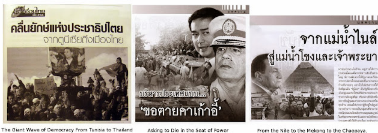
Image: From Thaksin Shinawatra’s “red” publications, left to right – “The Giant Wave of Democracy From Tunisia to Thailand,” “Asking to Die in the Seat of Power,” and “From the Nile to the Mekong, to the Chaopaya,” all indicate that Thaksin’s propagandists were likewise channeling the US State Department’s “Arab Spring” rhetoric as well as making the implicit threat that armed militancy was (and may still be) a desired option.

The number of armed supporters Thaksin could possess in Thailand to actually fight a “civil war” are minimal. Of the 10,000-30,000 supporters he is able to mobilize with cash payments and bus services at any given time, only about 1,000 could be considered fanatical, and out of that, fewer still who are of military age, willing, and physically able to take up arms against Thaksin’s enemies. Thaksin had clearly augmented this with professional mercenaries, drawn from paramilitary border units in the north and northeast, but these numbered only about 300 and were easily outmatched by the Thai military in 2010. Thaksin’s grip on the nation’s police forces allows him to produce on demand thousands from across his north and northeast political stronghold, but even if these police were armed, they lack the training, organizational skills, and coordination to pose any threat to the nation’s armed forces. They have proven in recent weeks to be completely ineffectual (and in some cases unwilling) against even unarmed protesters.