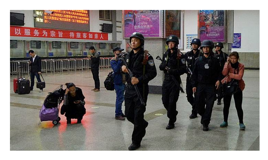
Indeed, first and foremost in backing the Xinjiang Uyghur separatists is the United States

Within China itself, the US wields terrorism as a means to destabilize and divide Chinese society in an attempt to make the vast territory of China ungovernable. In the nation's western province of Xianjiang, the United States fully backs violent separatists.