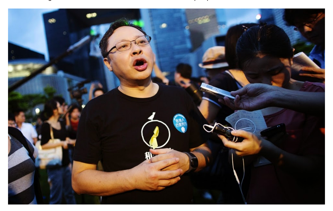
Image: Protest leader Benny Tai – <u>fully entwined with the US State Department's National Democratic Institute</u> – sitting as a director for years of the Centre for Comparative and Public Law (CCPL) which collaborates with and receives funding from the US government – calls for the "occupation" of Hong Kong.

government, it is their problem and theirs alone to solve in their own way. Using the promotion of "democracy" as cover, the US would continue its attempts to infect China with US-backed institutions and policies, subvert, co-opt, or overthrow the political order in Beijing, and establish upon its ashes its own neo-colonial order serving solely Wall Street and Washington's interests – not those of the Chinese people.