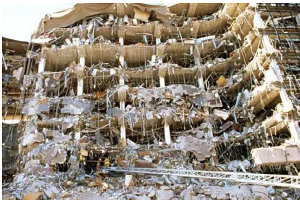
Oklahoma City Bombing

Recently I viewed for a film, "A Noble Lie," about the 1995 Oklahoma City bombing. 16 This gave me a chance, for the first time, to test these hypotheses against the case of Oklahoma City on April 19, 1995, or what I shall call 4/19. More than I could have anticipated, 4/19 fit into and strengthened this analysis.