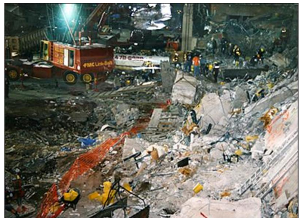
First World Trade Center bombing of 1993

Many have forgotten that there was a Phase One-Phase Two process with respect to 4/19 as well. Both immediately and thereafter there were a number of reports linking McVeigh and Nichols to Iraqis and other Middle Easterners, including Ramzi Yousef, the fugitive bomber in the 1993 World Trade Center bombing (which also used an ammonium nitrate (ANFO) bomb in a Ryder rental truck.) 29 Both Clinton and his Counterterrorism Coordinator, Richard Clarke, have confirmed that some of these stories were discussed at a meeting of the Counterterrorism Security Group on the day of 4/19. 30 Both men also claim to have dismissed them in favor of a low-grade Phase Two local conspiracy led by the two designated culprits: Timothy McVeigh and Terry Nichols. But reports of Middle Eastern involvement, sometimes attributed to sources inside government, continued to appear in the governing media, including CBS, NBC, and the New York Times . 31