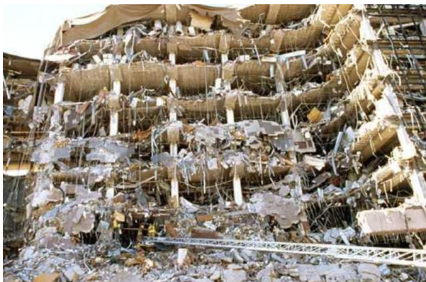
Oklahoma City Bombing

Recently I viewed for a film, "A Noble Lie," about the 1995 Oklahoma City bombing. 16 This gave me a chance, for the first time, to test these hypotheses against the case of Oklahoma City on April 19, 1995, or what I shall call 4/19. More than I could have anticipated, 4/19 fit into and strengthened this analysis.