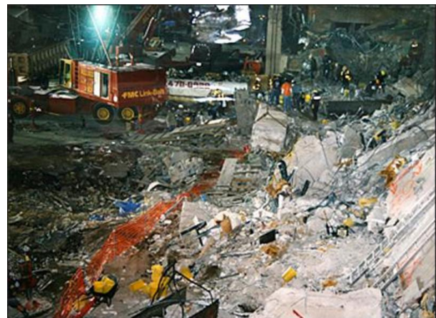
First World Trade Center bombing of 1993

Many have forgotten that there was a Phase One-Phase Two process with respect to 4/19 as well. Both immediately and thereafter there were a number of reports linking McVeigh and Nichols to Iraqis and other Middle Easterners, including Ramzi Yousef, the fugitive bomber in the 1993 World Trade Center bombing (which also used an ammonium nitrate (ANFO) bomb in a Ryder rental truck.) 29 Both Clinton and his Counterterrorism Coordinator, Richard Clarke, have confirmed that some of these stories were discussed at a meeting of the Counterterrorism Security Group on the day of 4/19. 30 Both men also claim to have dismissed them in favor of a low-grade Phase Two local conspiracy led by the two designated culprits: Timothy McVeigh and Terry Nichols. But reports of Middle Eastern involvement, sometimes attributed to sources inside government, continued to appear in the governing media, including CBS, NBC, and the New York Times . 31