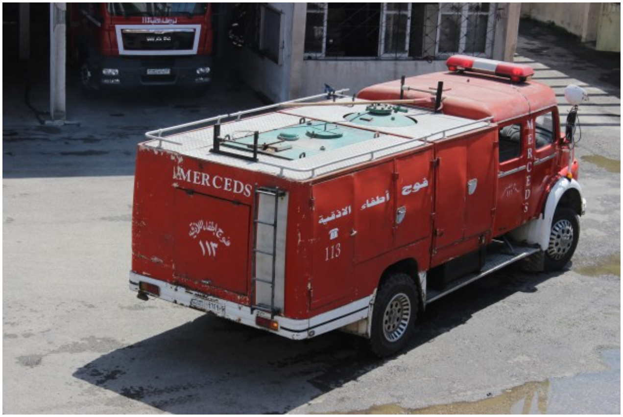
Latakia Fire Brigade centre, Latakia. Syria August 2016. The following is a <u>testimony written</u> by one of the Latakia crew members on 25th March 2016 to commemorate the events of 25th March 2011 when the "peaceful" protestors invaded the coastal areas of Latakia, Jableh and Tartous.

Part II of the series on the REAL Syria Civil Defence will be published at 21st Century Wire very shortly.