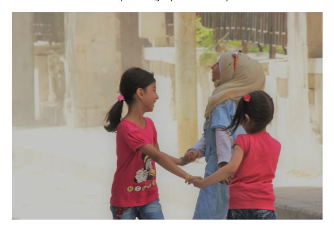
Children playing next door to Bana Alabed's deserted house in the midst of 20 Ex-Nusra Front military centres. August 2017

Despite its deep wounds and scars, Syria will rebuild and it will emerge, renewed, stronger, and more resilient than ever before. From out of the fire of neocolonialism, will be born a new more powerful Syria, wiser and reinforced by new alliances, the much strengthened historical alliances and expanded geopolitical savvy.