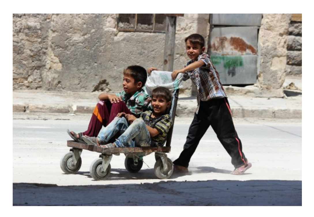
Kids in the Alsh'ar district. This street was occupied by over 1500 foreign and Syrian mercenaries, operating as Abu Amara brigade and Nusra Front, according to residents. August 2017

The following report from <u>Russia Today</u> further demonstrates the reality (admitted by the UN) that over 600,000 external refugees have returned to Syria, since the SAA and allies have advanced militarily and cleansed entire swathes of Syrian territory of the US Coalitionarmed and funded, terrorist-led insurgents.