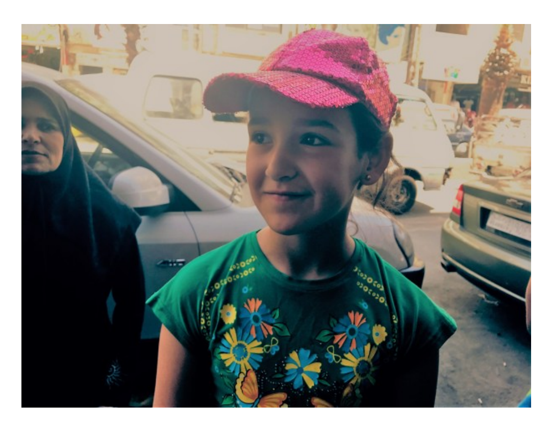
Young girl among the IDPs in Jaramanah, Damascus, dreaming of "going home". August 2017

"Nothing is the same here, nothing is like my home"