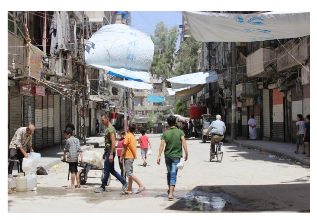
Sid Al'Ose returns to "normal" after the liberation of East Aleppo from Nusra Front dominated occupation, by the SAA and allies. August 2017

One shopkeeper, however, did tell us that the area next to his shop was where the terrorists had brought the bodies of 7 civilians who had been murdered at the Bayan hospital (see above photo), close by. They had been shot multiple times and one had been flung from the multi-storey roof of the Bayan hospital. Their bodies had then been dumped outside the lock-up, in the street, as a warning to residents to stay where they were and not to attempt to escape East Aleppo for the safety of West Aleppo.