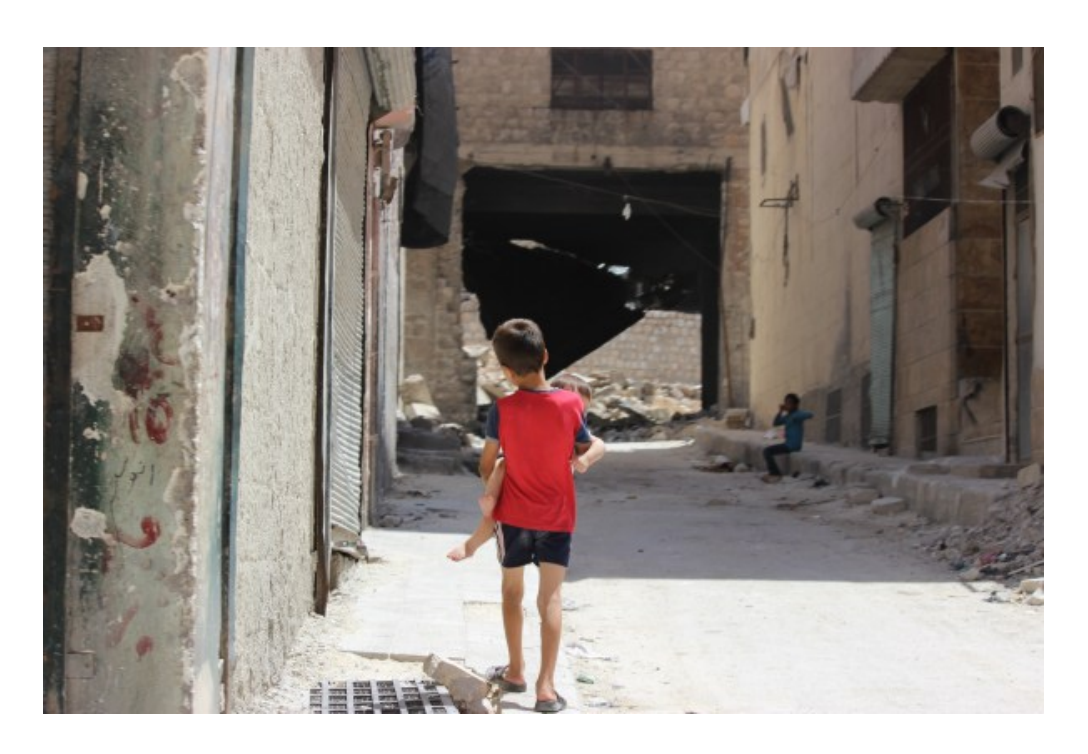
Young boy carrying baby in Alsh'ar neigborhood. August 2017