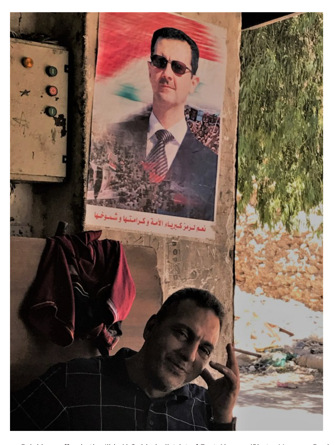
Drinking coffee in the Jibb Al Qubbeh district of East Aleppo. (Photo: Vanessa Beeley). August 2017