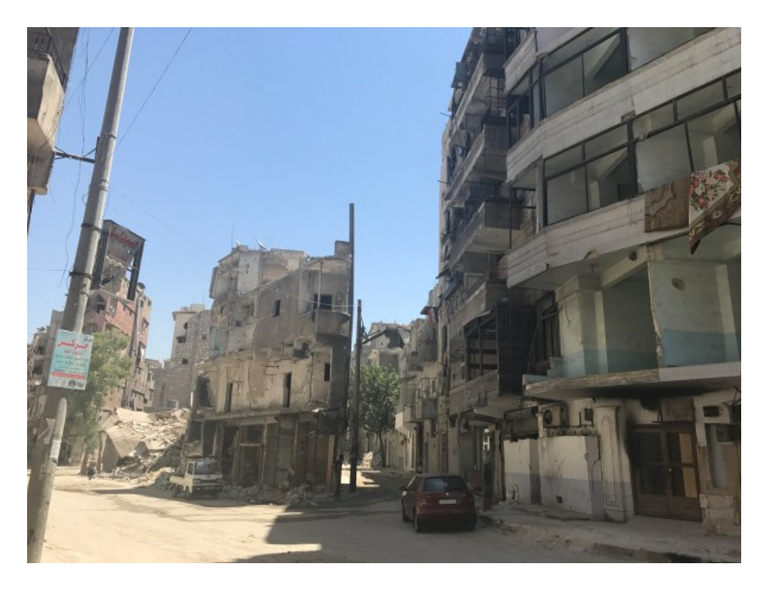
Bayan hospital (on right) in the Alsh'ar district of East Aleppo. August 2017

One shopkeeper, however, did tell us that the area next to his shop was where the terrorists had brought the bodies of 7 civilians who had been murdered at the Bayan hospital (see above photo), close by. They had been shot multiple times and one had been flung from the multi-storey roof of the Bayan hospital. Their bodies had then been dumped outside the lock-up, in the street, as a warning to residents to stay where they were and not to attempt to escape East Aleppo for the safety of West Aleppo.