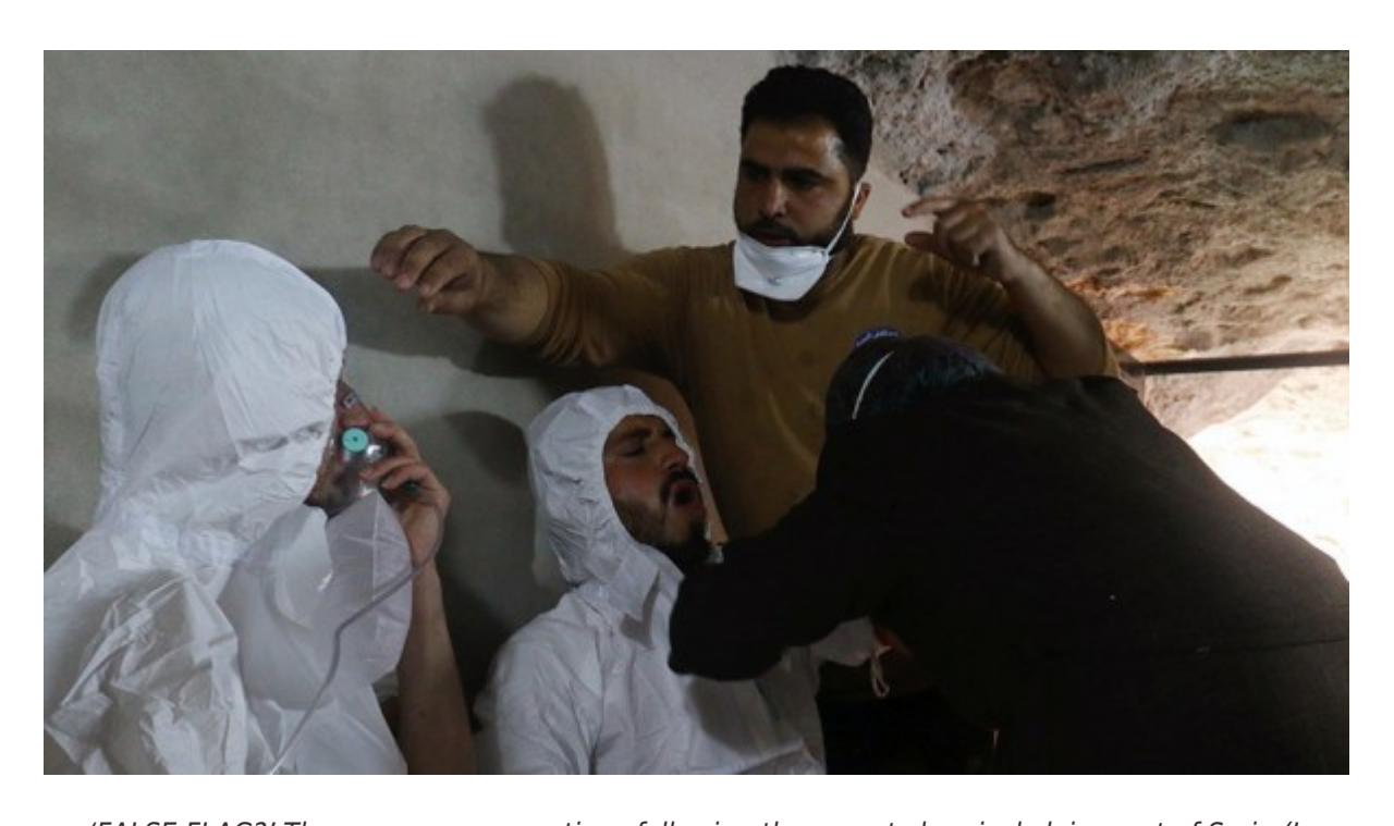
'FALSE FLAG?' There are many questions following the recent chemical claims out of Syria

"The first news and Turkish reports to the UN speak of chlorine, not sarin. It is only the Turkish Health Minister who mentions sarin – in parentheses, but then lists a symptom of severe chlorine exposure as one of sarin. Neither the casualties nor the unprotected medical personal involved in the incident show any effect of sarin exposure. The only one who claimed "sarin" early on was an al-Qaeda aligned former doctor in a staged propaganda video."