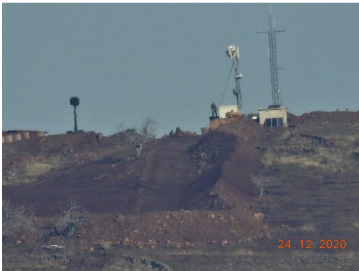
The Turkish military base in Quqfin providing surveillance for HTS/Al Qaeda.

enabling war crimes and committing them, according to Syrian residents in Jurin.