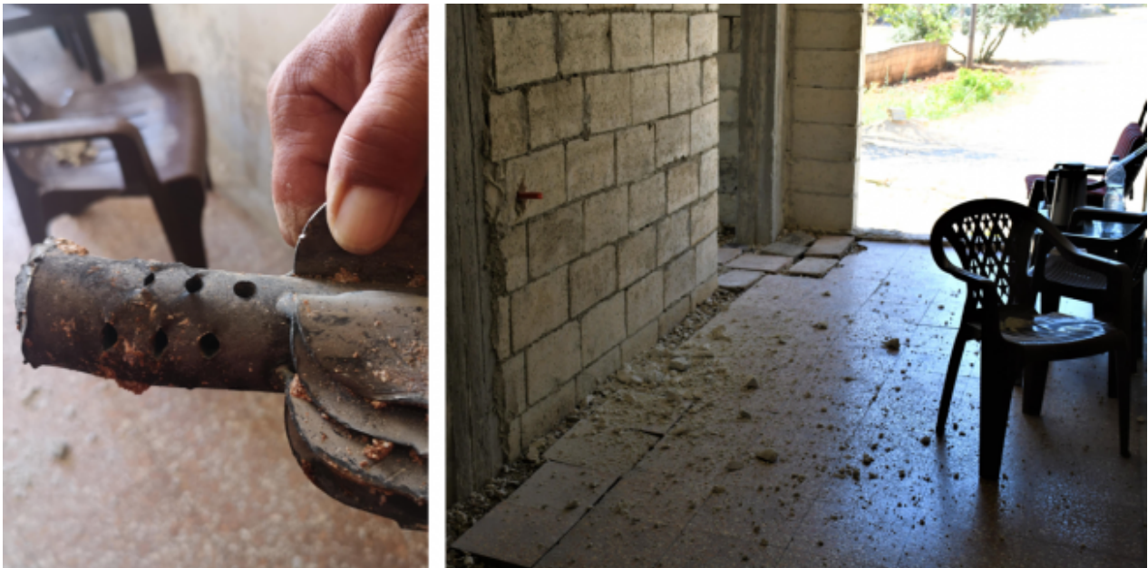
On left the rocket that targeted the Saleh household on 15/7/2021 and on the right the debris from the strike in the hallway.

Saleh informed me that the armed groups target schools, residential areas and civilian infrastructure. They even targeted a funeral procession and a condolences gathering two years ago, according to Saleh. He describes the Turkish and armed group destruction of the land. Saleh talks of the intensification of militant aggression to target Russian/Syrian humanitarian corridors that are an effort to allow Syrian civilians to safely escape the armed occupation of north-west Syria.