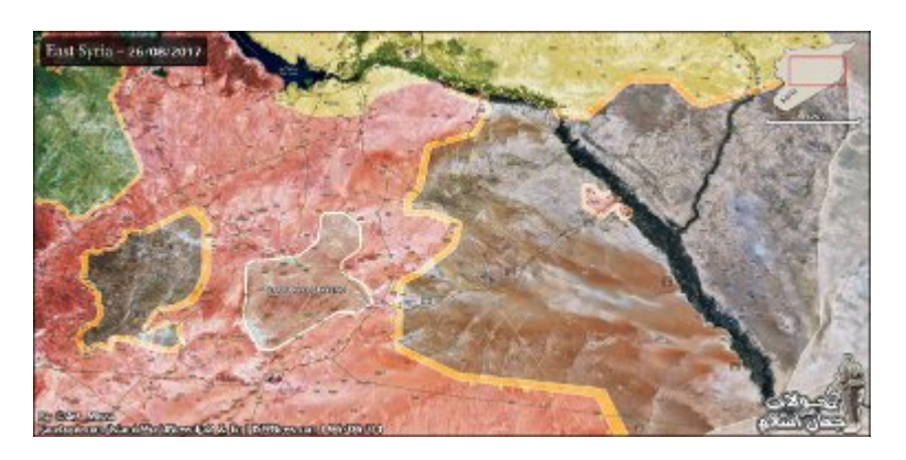
Map by Islamic World News - see bigger picture here

A second pocket is in the semi desert north-west of Palmyra. ISIS fighters there have dug elaborate cave systems (video). The caves may protect against detection from the air but these positions are indefensible against a ground assault. The area will likely be cleansed within a week.