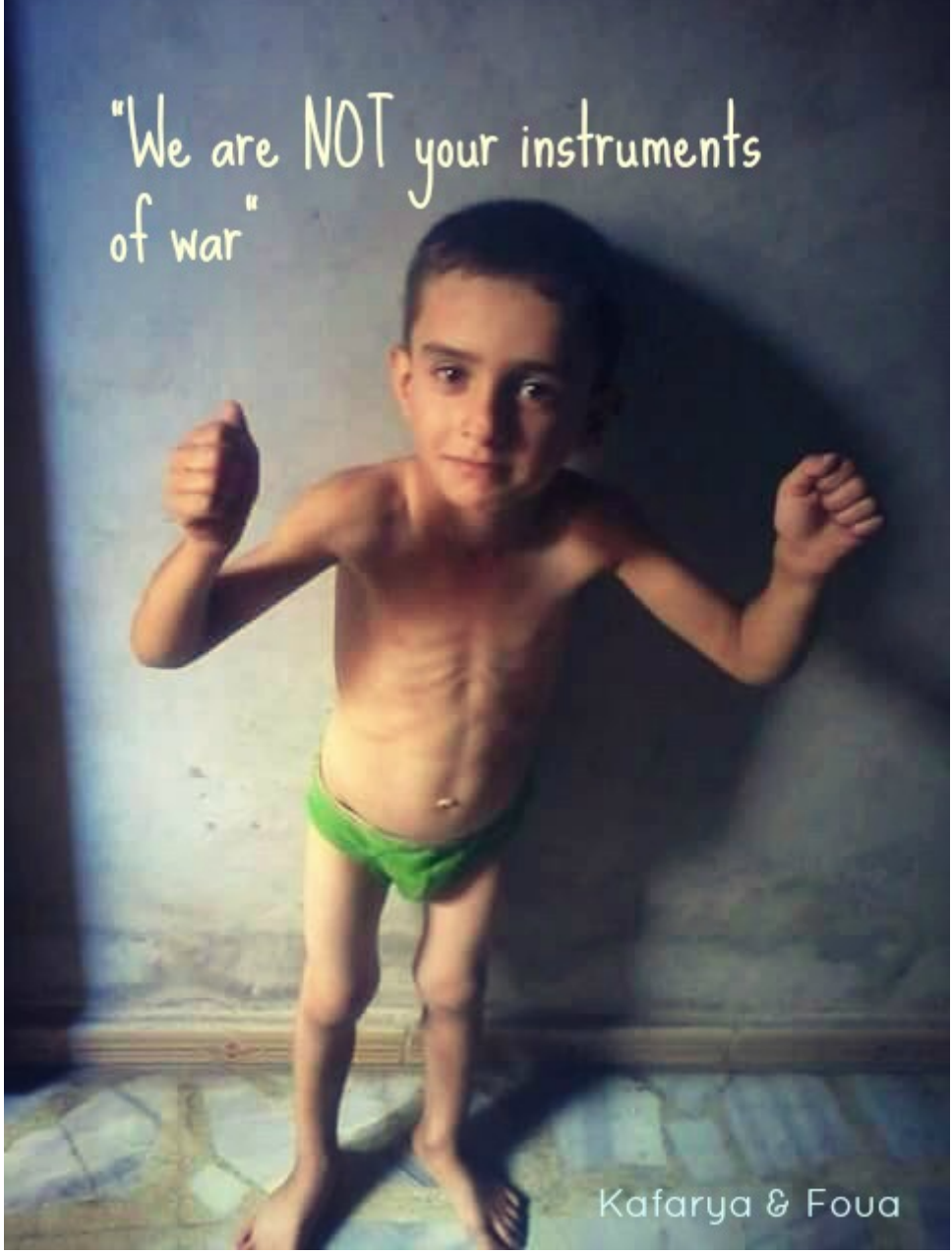
Starving child in Kafarya and Foua besieged by US supported terrorists, Ahrar al Sham and Nusra Front.

The original source of this article is <u>21st Century</u> Copyright © <u>Vanessa Beeley</u>, <u>21st Century</u>, 2016