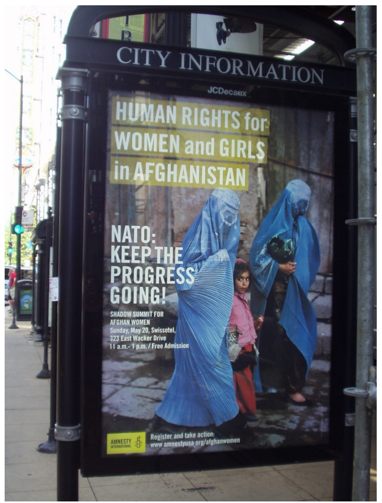
The infamous Amnesty International 2012 campaign: "<u>Human Rights for Women and Girls in</u> <u>Afghanistan" and "NATO: Keep the Progress Going!</u>

Read more on the NGO complex and its role in de-stablizing nations prior to and during US, NATO state illegal interventions in this 21st Century Wire article: <u>An Introduction: Smart</u> <u>Power and the Human Rights Industrial Complex</u>